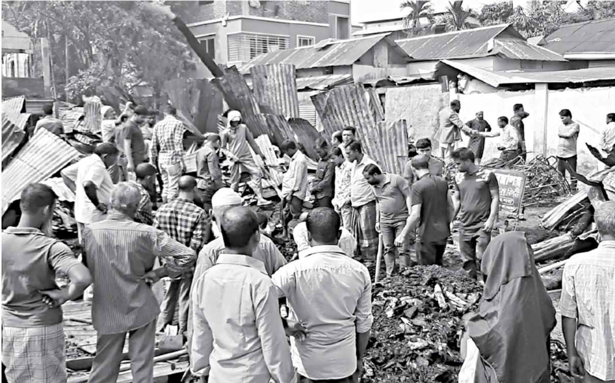
At least six cloth shops and three dwelling houses were gutted in a devastating fire that broke out in Modhya Bazar area under Durgapur municipality in Netrakona on Wednesday.