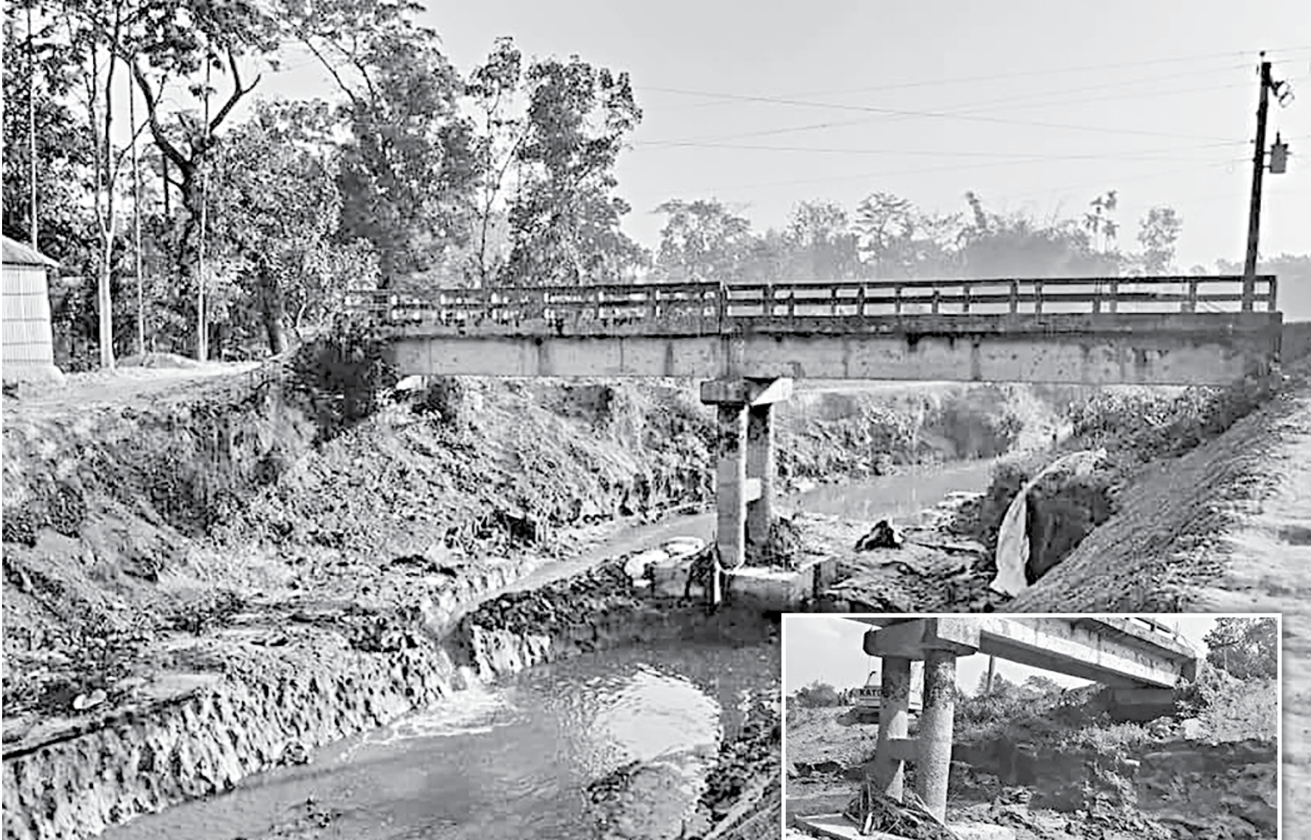
Lifting of earth just under this bridge over the Fanai River in Kulaura upazila of Moulvibazar poses threat to the structure. Inset, a closer view of the effect of the callous act.