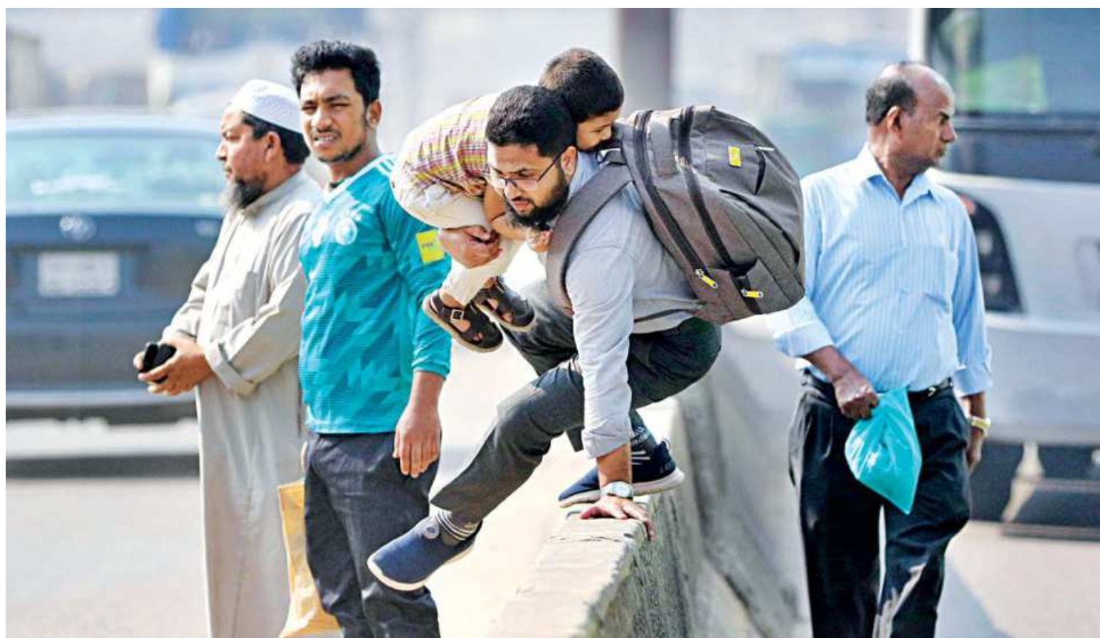
Holding a child with one hand and using the other to balance his body weight, a pedestrian jumps over a median strip to cross the Dhaka-Mymensingh highway in the capital's Azampur of Uttara. Although there is a footbridge yards away, many cross the busy road this way every day, putting lives at risk. The photo was taken around 9:30am yesterday.

RELATED STORY ON PAGE 2 SEE PAGE 2 COL 3