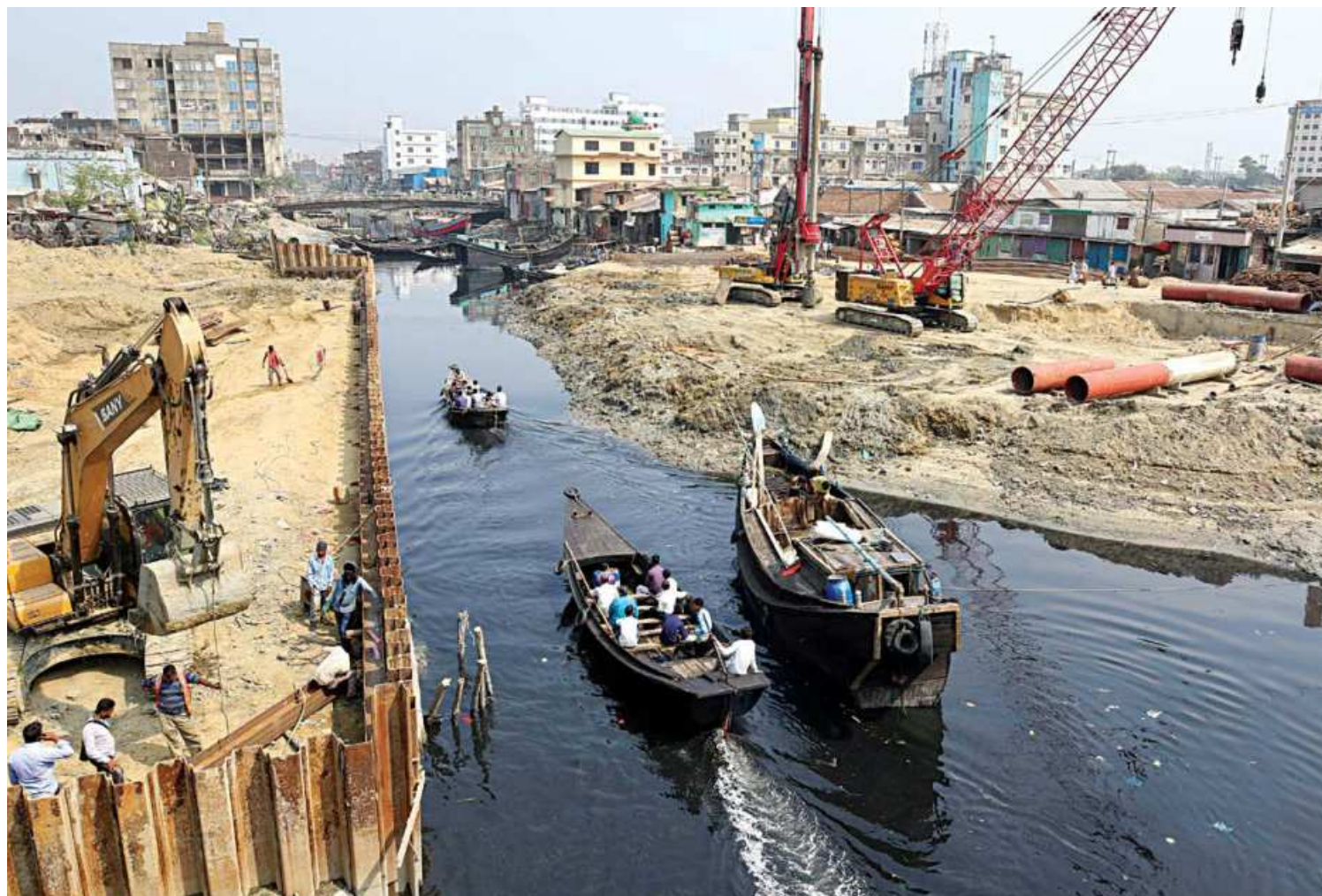
Chaktai canal has shrunk at this point near Mariner's Drive Road in Chattogram city due to the construction of a regulator to control water flow. The photo was taken yesterday.