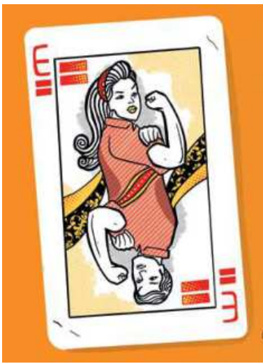
Illustration: Ehsanur Raza Ronny

91 countries, just over 50% of firms didn't have any female executives (only 11% of firms had all-female executives) ● 50% of women in STEM fields will eventually leave because of hostile work environments