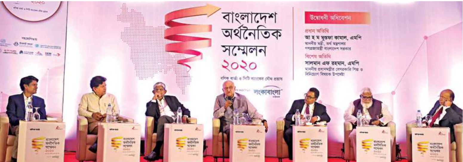
CPD Chairman Rehman Sobhan speaks at a discussion styled "Bangladesh's economy: Envious Growth and Sustainable Development" at the Bangladesh Economic Conference 2020 at the Pan Pacific Sonargaon Dhaka yesterday. Finance Minister AHM Mustafa Kamal, third from right, and Salman F Rahman, second from right, adviser to the prime minister on private industry and investment, were present.