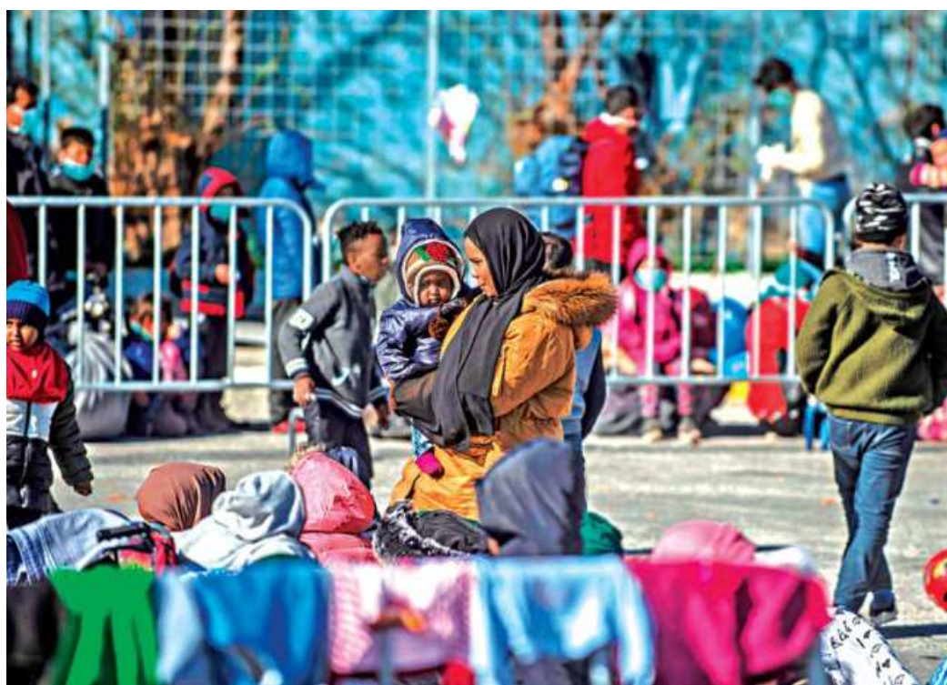
Migrants disembarked in the last three days on Lesbos Island, waits in the port of Lesbos, Greece yesterday. Greece was on a state of alert as it faced an influx of thousands of migrants seeking to cross the border from Turkey, with locals fearing a new immigration crisis.