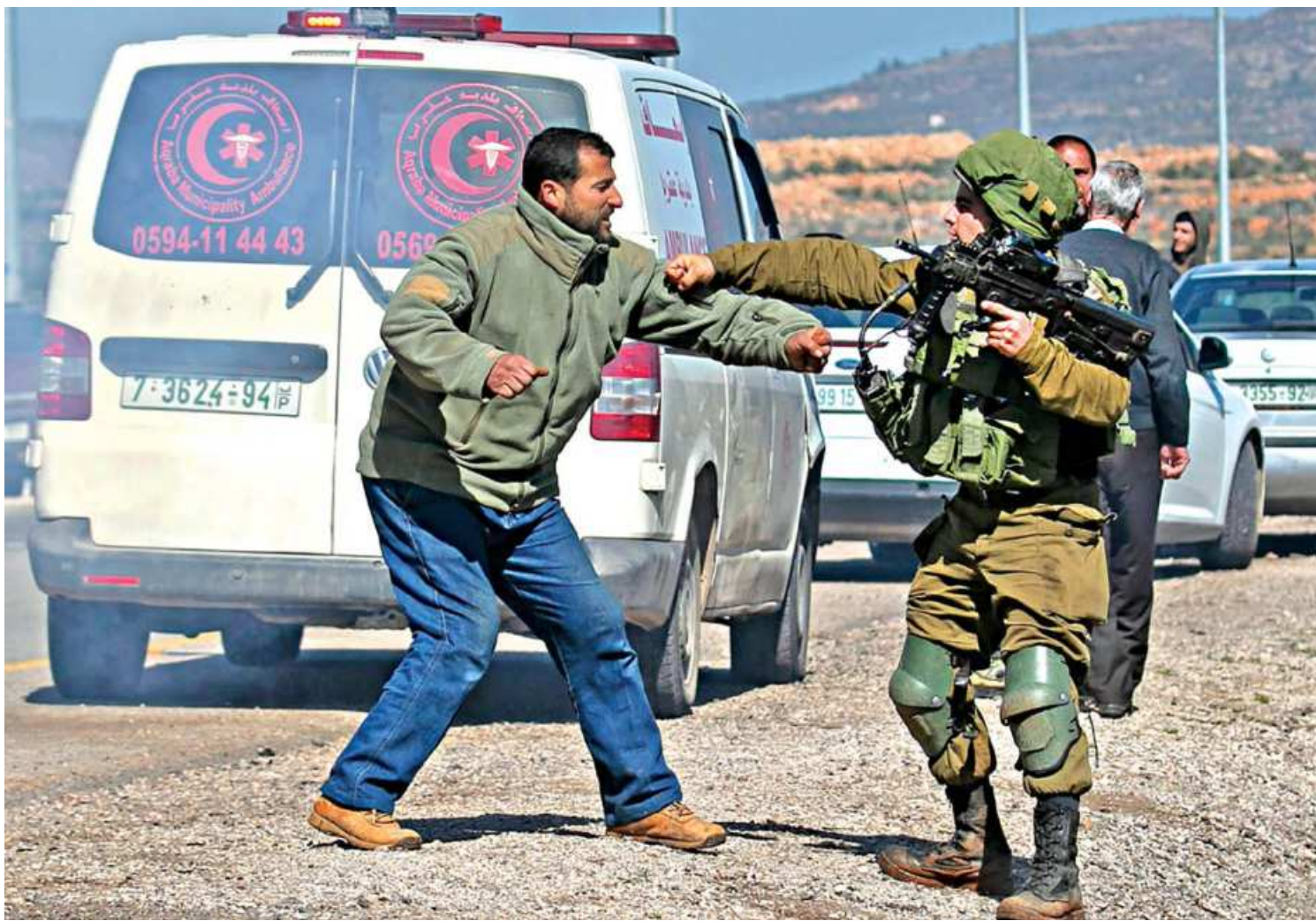
A Palestinian protester scuffles with an Israeli soldier after Israeli tractors started working on a Palestinian land near the village of Aqraba, south of Nablus, in the Israeli occupied West Bank, yesterday.

Russia's main opposition leader Alexei Navalny said yesterday that authorities had frozen all of his bank accounts and those of his family, including his elderly parents. The 43-year-old anti-corruption blogger, who has emerged as President Vladimir Putin's most prominent critic, accused the Russian authorities of seeking to strangle him financially at a time when the Kremlin appears to be seeking to consolidate power during a sensitive transition period.