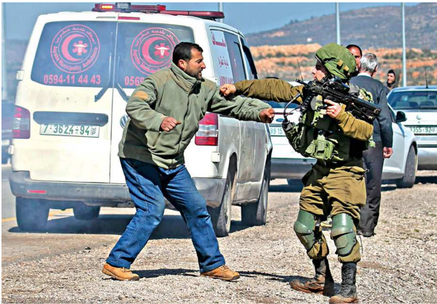
A Palestinian protester scuffles with an Israeli soldier after Israeli tractors started working on a Palestinian land near the village of Aqraba, south of Nablus, in the Israeli occupied West Bank, yesterday.

AFP, Moscow Russia's main opposition leader Alexei Navalny said yesterday that authorities had frozen all of his bank accounts and those of his family, including his elderly parents.