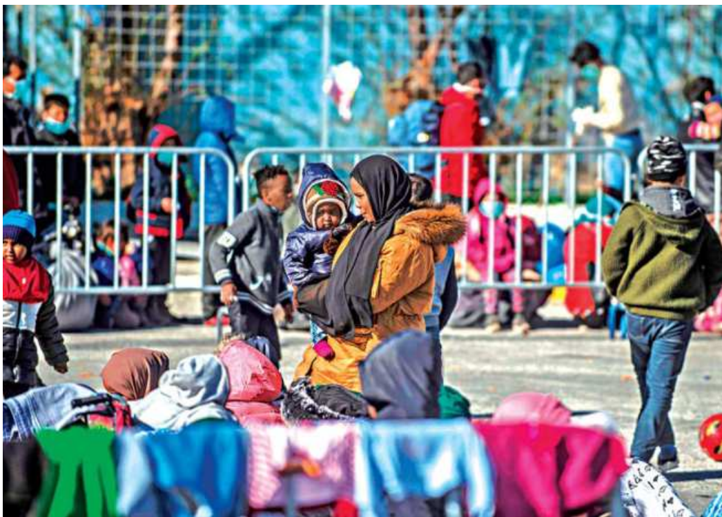
Migrants disembarked in the last three days on Lesbos Island, waits in the port of Lesbos, Greece yesterday. Greece was on a state of alert as it faced an influx of thousands of migrants seeking to cross the border from Turkey, with locals fearing a new immigration crisis.