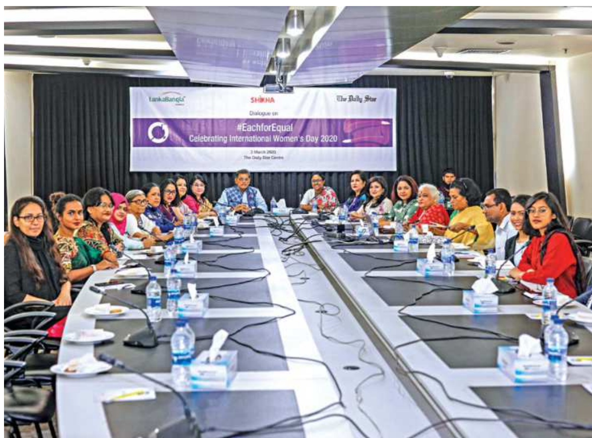
A discussion titled "#EachforEqual: Celebrating International Women's Day 2020" was held at The Daily Star Centre yesterday. It was jointly organised by LankaBangla Finance Limited and The Daily Star.