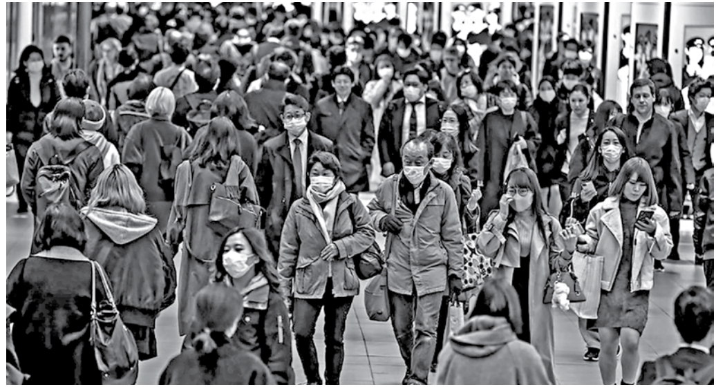
Crowds wearing protective masks following the coronavirus outbreak are seen at Shinjuku station in Tokyo yesterday.

There are more than 90,000 cases globally, with more than 80,000 of them in China, and infections appearing in 77 other countries and territories, with Ukraine the latest country to report its first case. China's death toll is at 2,943 with more than 75 deaths elsewhere. New cases in China have been falling sharply, with 125 reported on Tuesday, thanks to its aggressive measures to stop the spread of the disease. After what critics said was an initially hesitant response to the virus, China imposed sweeping restrictions, including suspensions of transport, sealing off communities affecting tens of millions of people, and extending a Lunar New Year holiday across the country.