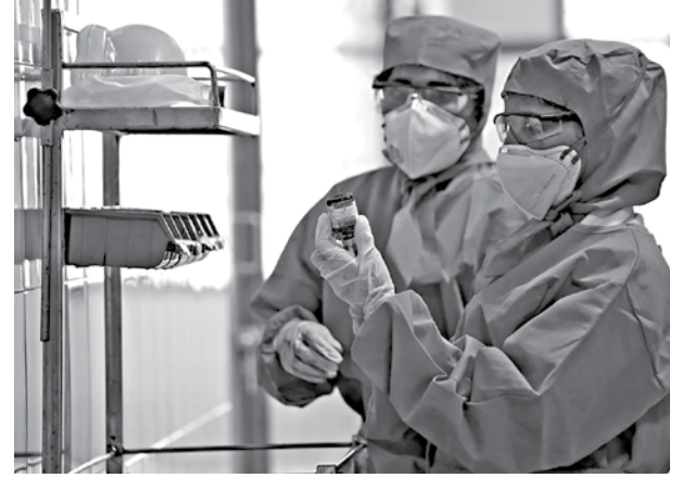
Medical staff wearing protective gear are seen inside a ward, specialised for people who may have been infected with coronavirus, at the Rajiv Gandhi Government General hospital in Chennai.