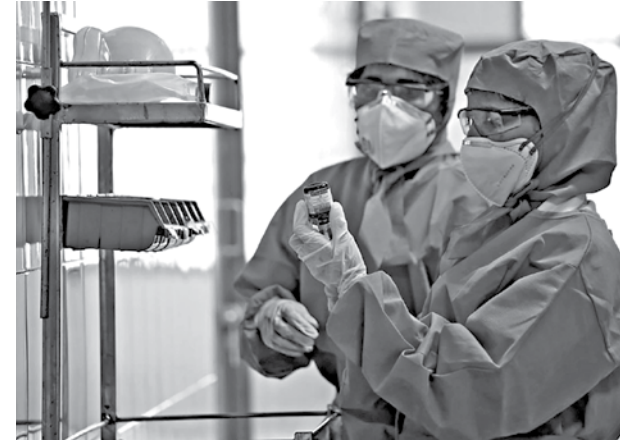
Medical staff wearing protective gear are seen inside a ward, specialised for people who may have been infected with coronavirus, at the Rajiv Gandhi Government General hospital in Chennai.

The people have been kept in isolation and their samples are being sent to India's National Institute of Virology for confirmation, the government said in a