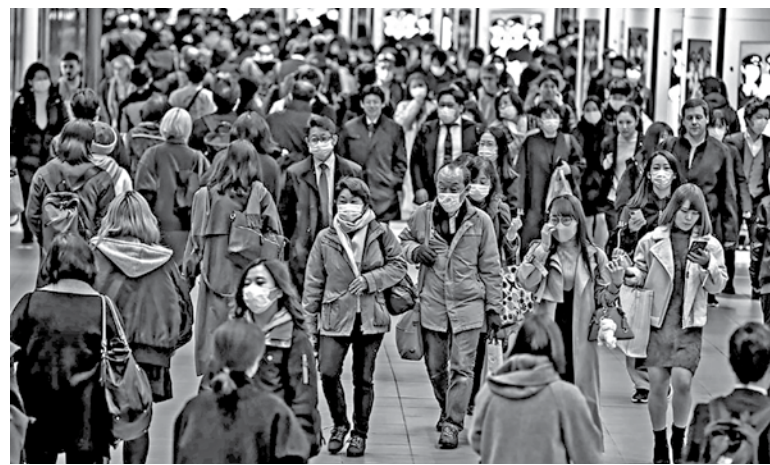
Crowds wearing protective masks following the coronavirus outbreak are seen at Shinjuku station in Tokyo yesterday.

Asked if all appropriate policy steps would include both monetary and fiscal policies, Aso said: "Yes,