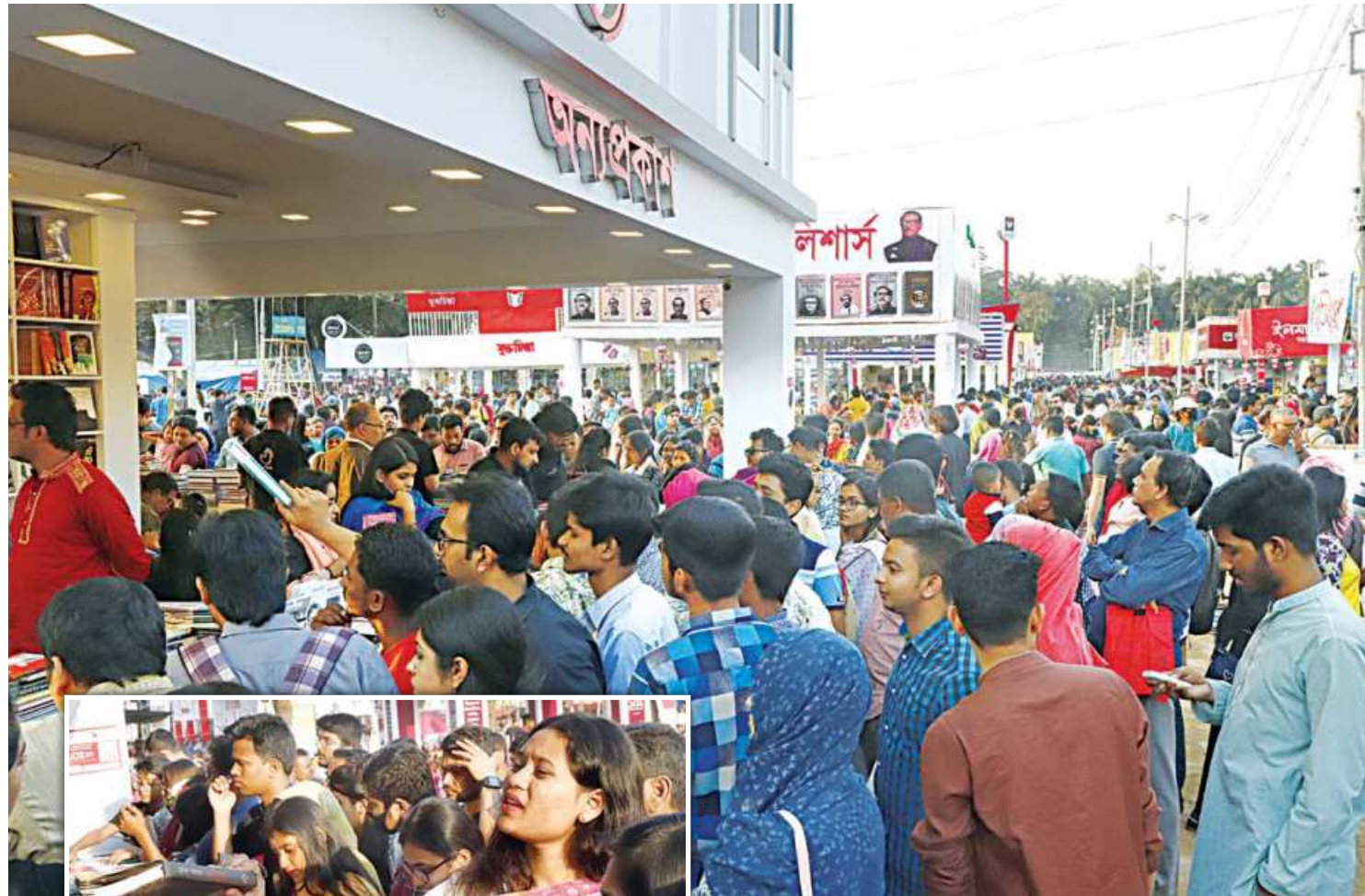
People thronging the Amar Ekushey book fair at Suhrawardy Udyan in the capital on the last day of the month-long event yesterday, which was also a weekend. Inset, buyers at a book stall.