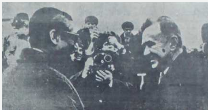
Alexei Kosygin, prime minister of the Soviet Union, receiving Bangabandhu at Vnukovo Airport in Moscow on March 1, 1972.

'My country is irrevocably committed to democracy'