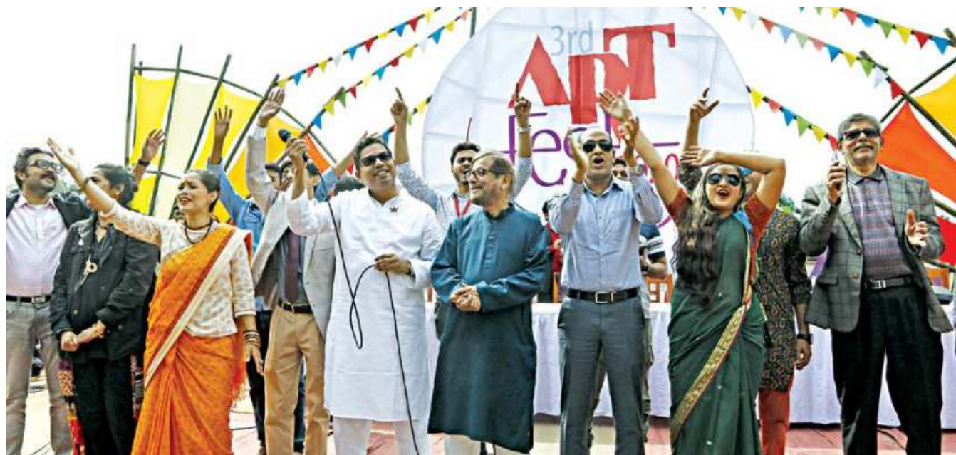
State Minister for ICT, Zunaid Ahmed Palak and Former Cultural Affairs Minister Asaduzzaman Noor (C) rejoice with the organisers of the festival.

Asaduzzaman Noor thanked the management for successfully hosting the festival in his home town. His majestic recitation of excerpts from Syed Shamsul Haq's famous poetic drama, Nuruddin er