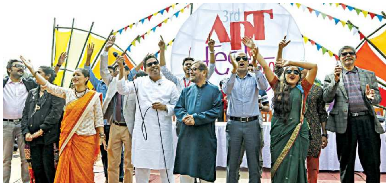
State Minister for ICT, Zunaid Ahmed Palak and Former Cultural Affairs Minister Asaduzzaman Noor (C) rejoice with the organisers of the festival.

Asaduzzaman Noor thanked the management for successfully hosting the festival in his home town. His majestic recitation of excerpts from Syed Shamsul Haq's famous poetic drama, Nuruddin er