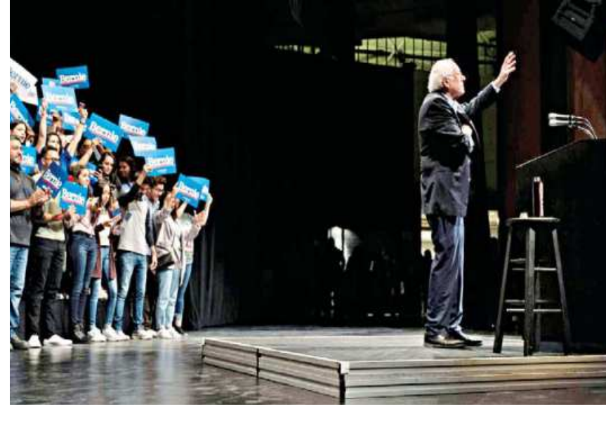
Voters likely see in Sanders someone who speaks convincingly to lost hopes and wants fundamentally to change a system that no longer offers them a credible path forward.

Then, the millennium turned and the American Century was laid low by three successive existential body blows: the 9/11 terrorist attacks, misconceived and inconclusive wars in Afghanistan and Iraq, and the 2008 global financial crisis. For more than a decade since the crisis, policymakers have tried everything to boost economic growth, for nothing lifts more boats. And yet debate still rages about what can be done to restore 4 percent annual GDP growth. The answer is probably nothing sustainable, as extreme tax cuts have shown. Simply put, the US economy grew abnormally fast for the century after the Civil War, because human life