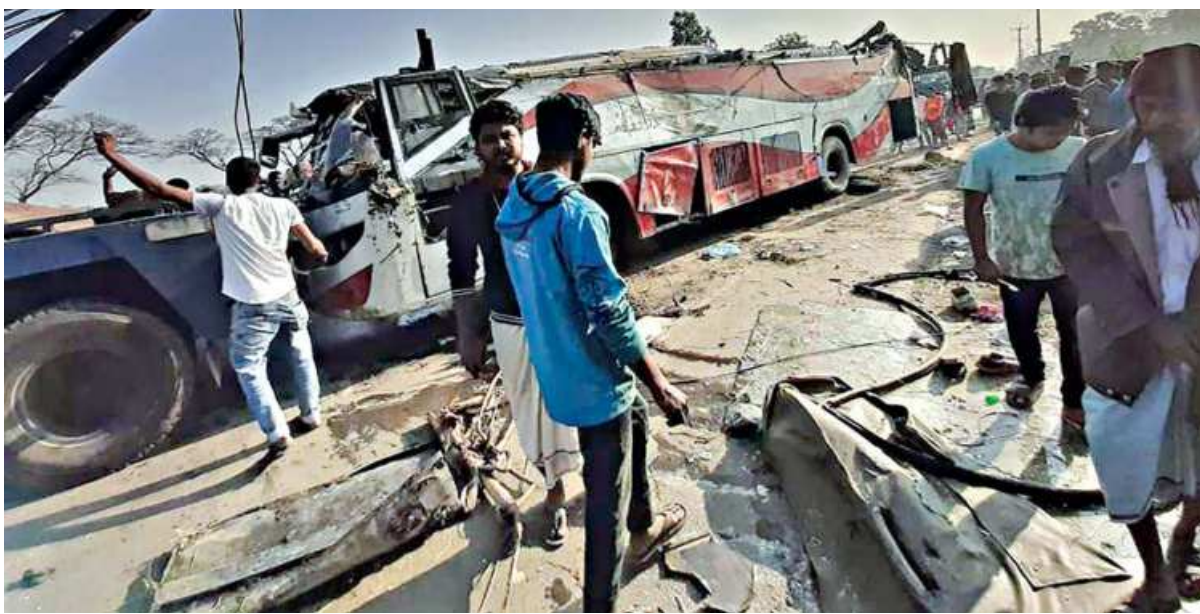
A wrecked bus is being towed away hours after it fell into a roadside ditch around 7:00am yesterday. At least three people were killed and 15 others injured in the crash.

"The second samples of the inmates will be taken on the fourteenth day of the quarantine period and all those whose results are negative will be released from the ITBP centre," the spokesperson said.