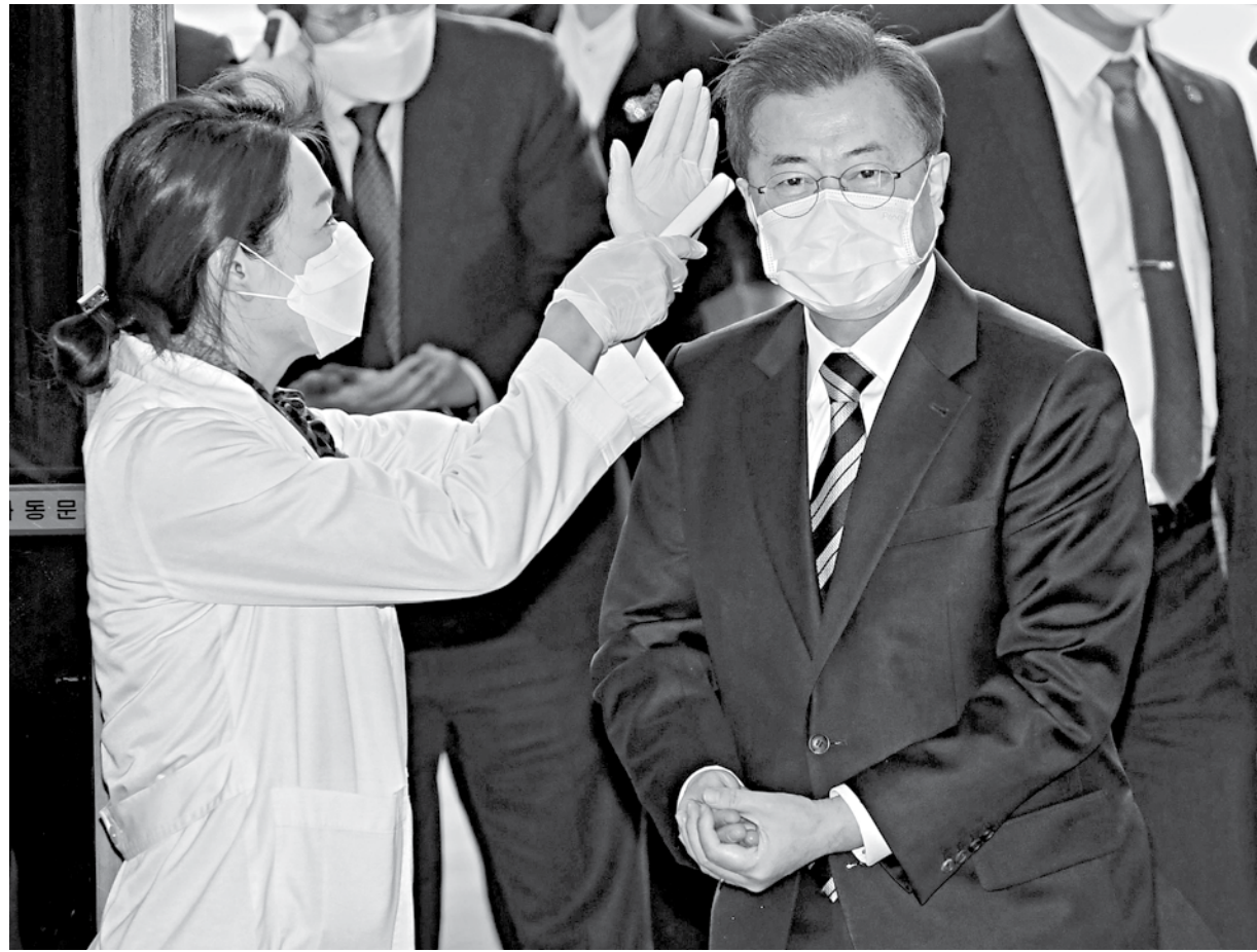
(Clockwise from left) South Korean President Moon Jae-in (R) has his body temperature checked as he arrives at the National Assembly in Seoul yesterday. Cooks wearing hazardous material suits prepare lunch for workers at a garment factory, the Zhejiang Ugly Duck Industry in Wenzhou, China. A soldier checks the body temperature of a visitor to the 68 Nigerian Army Reference Hospital at Yaba in Lagos.

More than 133 countries imposed entry restrictions on Chinese citizens to prevent the spread of the disease