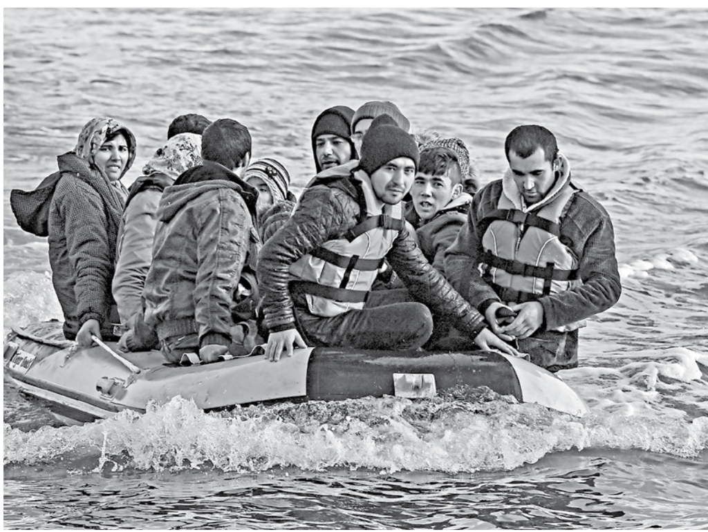
A dinghy with 15 Afghan refugees approaches the shore of the Greek island of Lesbos yesterday. Turkey will no longer close its border gates to refugees who want to go to Europe, a senior official said.

Muslim neighbours gathered to offer blessings as the groom arrived and the wedding rituals took place, with a Hindu priest reciting holy verses and the groom and bride taking the rounds of a small pyre set up inside the house.