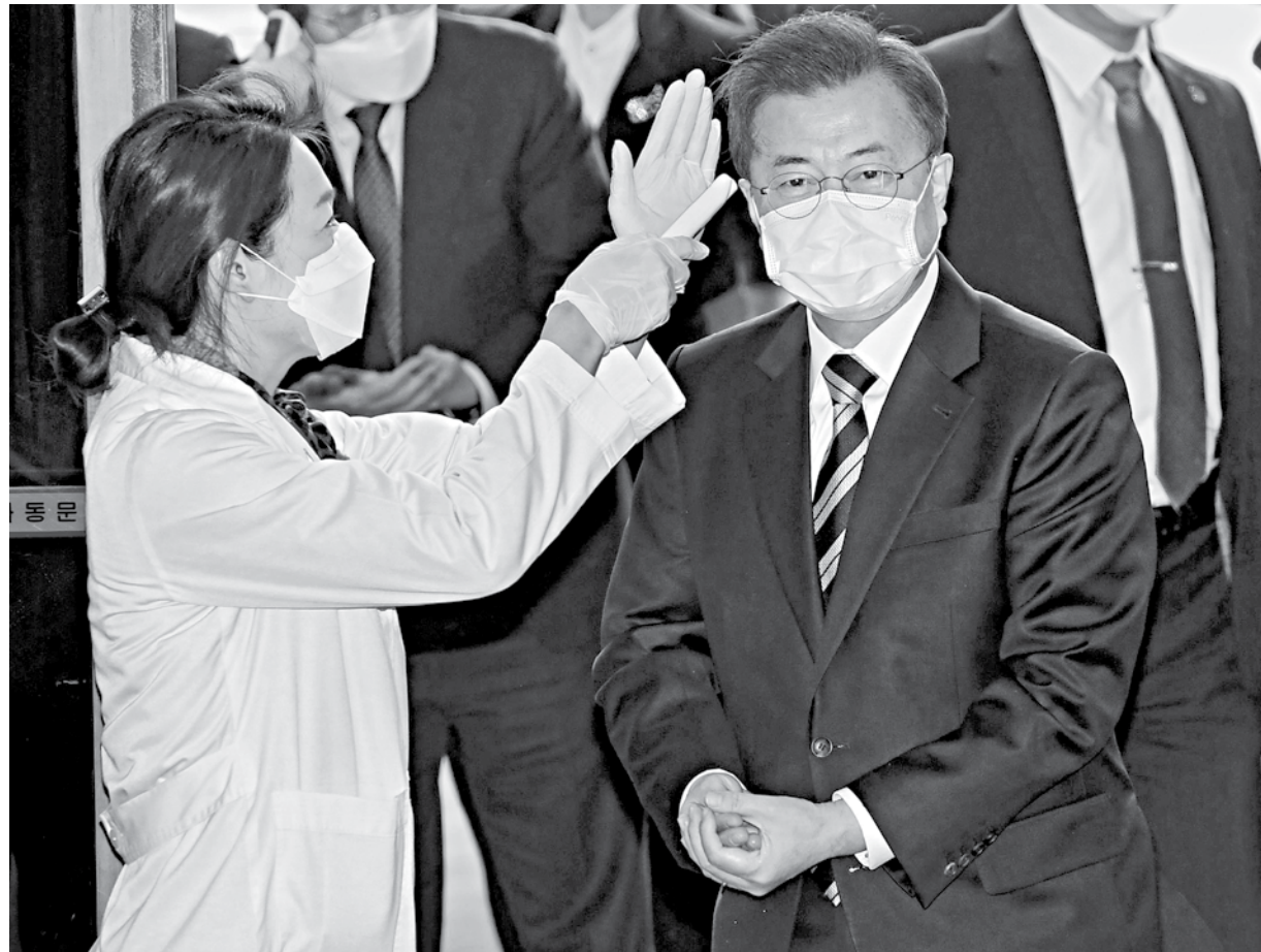
(Clockwise from left) South Korean President Moon Jae-in (R) has his body temperature checked as he arrives at the National Assembly in Seoul yesterday. Cooks wearing hazardous material suits prepare lunch for workers at a garment factory, the Zhejiang Ugly Duck Industry in Wenzhou, China. A soldier checks the body temperature of a visitor to the 68 Nigerian Army Reference Hospital at Yaba in Lagos.