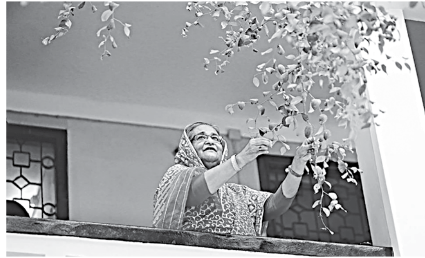
'Hasina: A Daughter's Tale' revolves around its central character, Prime Minister Sheikh Hasina.