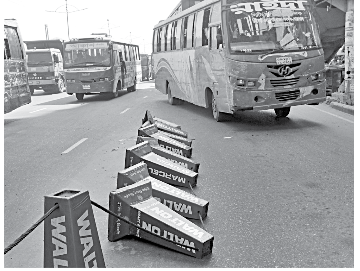
Dividers, which were placed by authorities to organise traffic movement, now remain toppled over, creating more obstruction on the road instead of solving the problem. This photo was taken yesterday from the capital's Khilkhet area.

The deceased were identified as Ful Banu Begum (65) and Al-Amin (27). The accident occurred as Ful Banu was crossing the road. Al-Amin, driver of the truck, died after his vehicle lost control and hit a tree by the road.