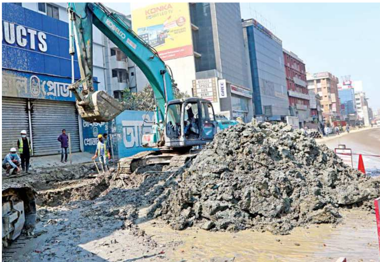
Traffic remained halted near House Building intersection in Uttara yesterday morning, after a gas line leaked, reportedly due to ongoing construction work on the road. The situation was brought to normalcy later in the day after workers fixed the leak.

facebook.com/ikabirphotographs or follow ihtishamkabir on Instagram.