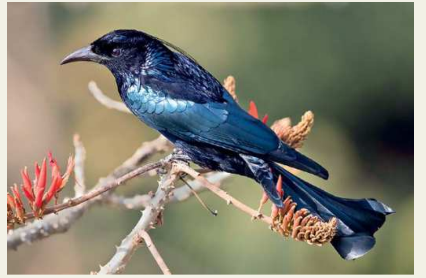
Hair-crested Drongo, Satchori National Park.