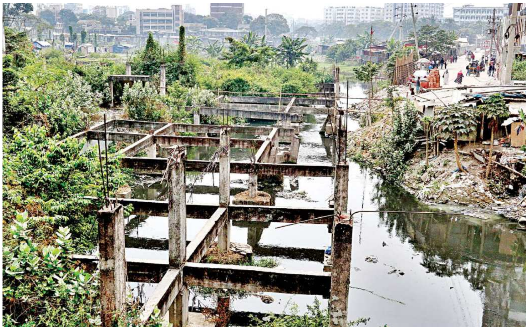
Three partially constructed buildings stand on the Baunia canal in BRP residential area in the capital's Mirpur-14, disrupting water flow. The contractor which was building these illegally on the canal stopped work and left nearly seven years ago. The photo was taken last week.