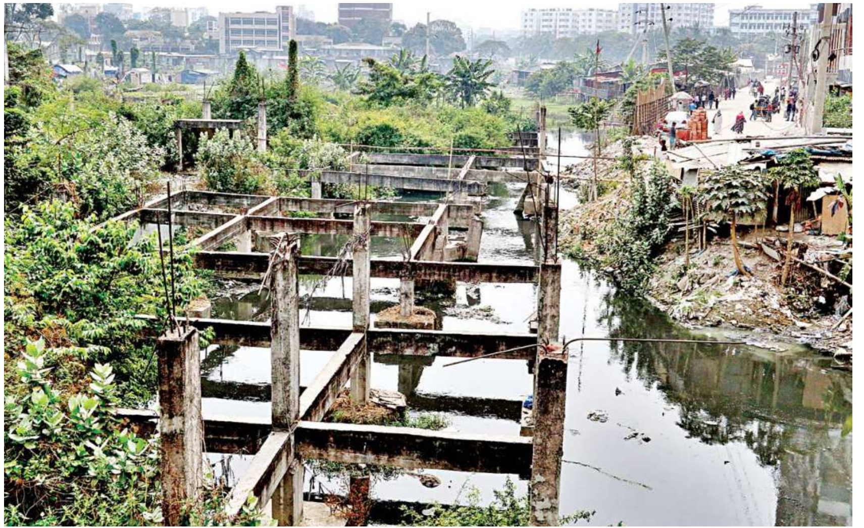
Three partially constructed buildings stand on the Baunia canal in BRP residential area in the capital's Mirpur-14, disrupting water flow. The contractor which was building these illegally on the canal stopped work and left nearly seven years ago. The photo was taken last week.