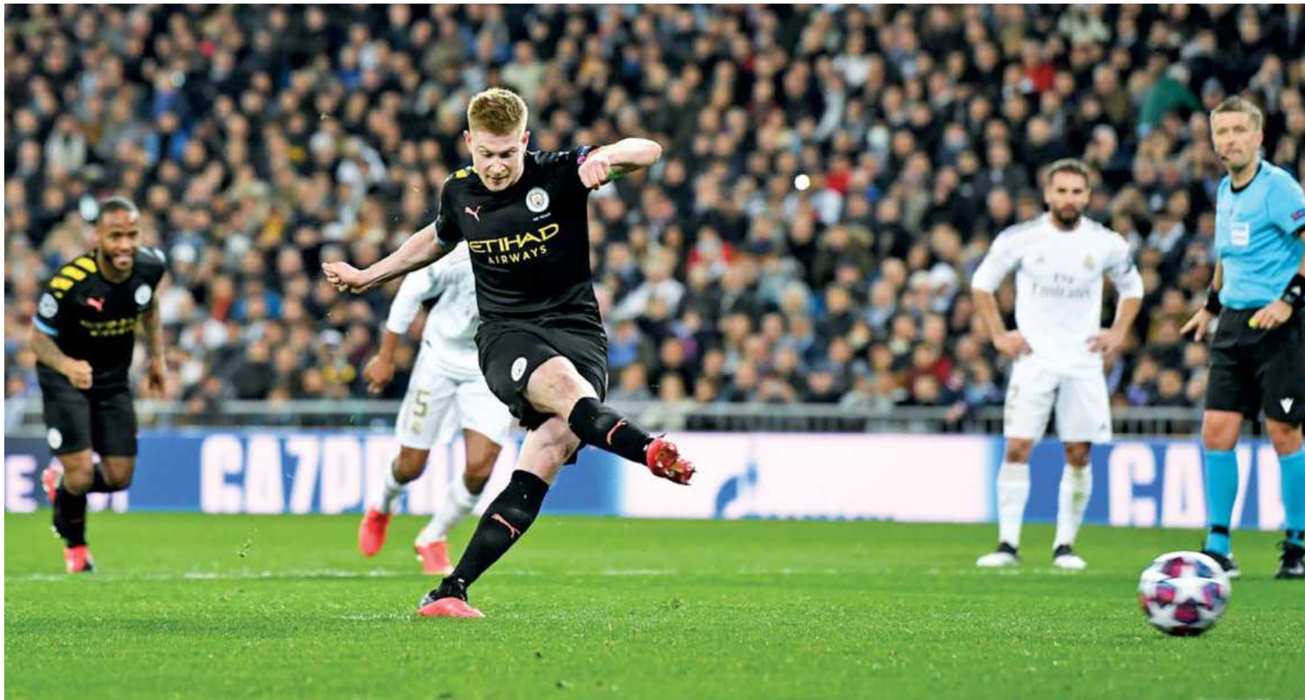
Kevin de Bruyne played out of position as Pep Guardiola selected him to lead the line against Real Madrid, but the Belgian put in a masterful display, picking up an assist to bring his team level at the Bernabeu before firing home from the spot to make it 2-1 in their Champions League Round of 16 first leg clash on Wednesday.