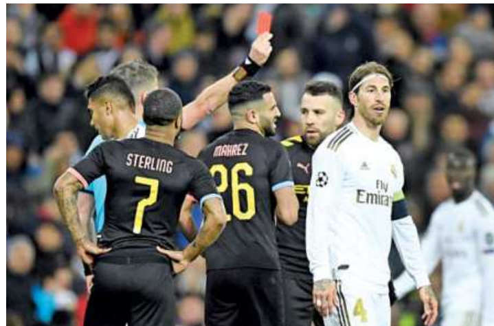
Real Madrid defender Sergio Ramos was shown a late red card -- his 26th -- meaning he will miss the second leg.

But it was on the minds of travelling fans, who were singing against European football's governing body from almost the first minute.