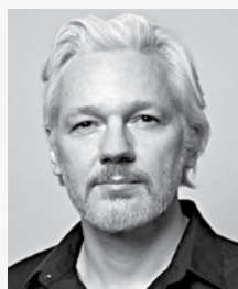
JULIAN ASSANGE (Born 1971)

Australian computer programmer who founded the media organisation WikiLeaks.