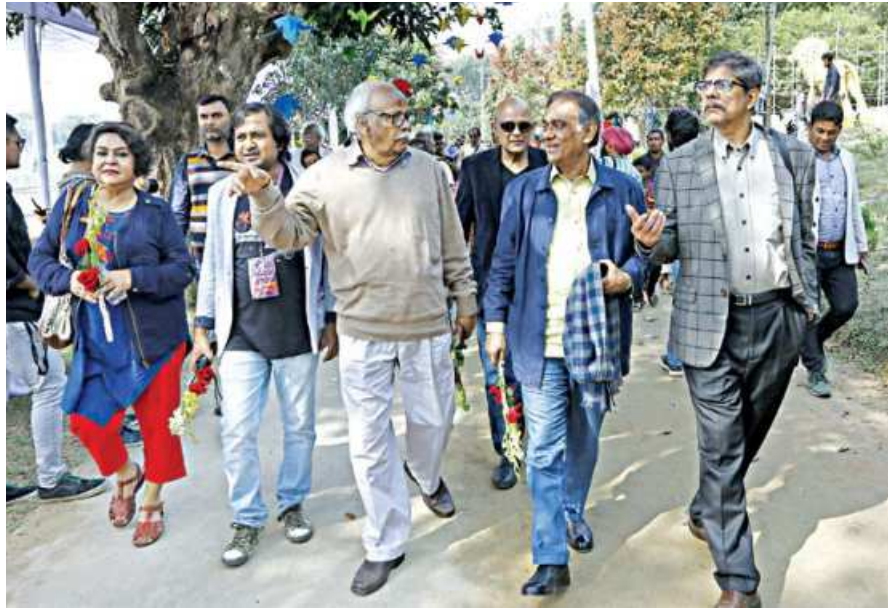
The festival features artists from Bangladesh, India, USA, Nepal and Myanmar.

ZAHANGIR ALOM, writes from Nilsagor, Nilphamari