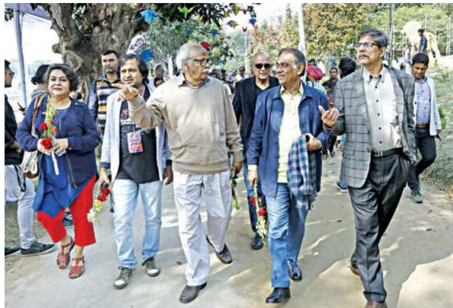
The festival features artists from Bangladesh, India, USA, Nepal and Myanmar.

ZAHANGIR ALOM, writes from Nilsagor, Nilphamari