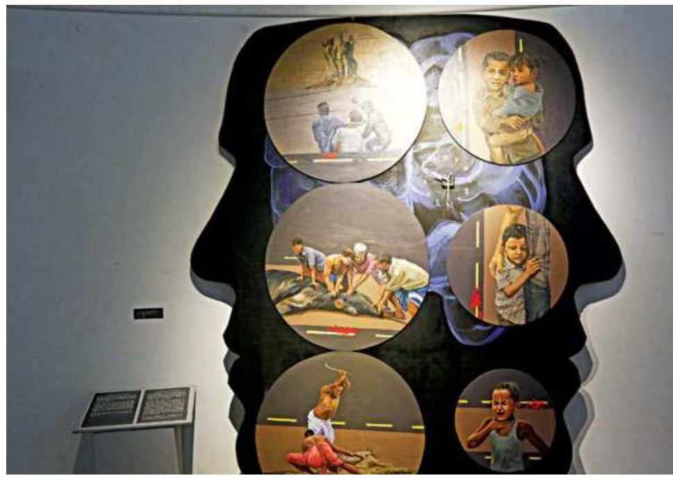
(From left) 'Mysterious Migration of Hercules' (Acrylic on board) and 'The Act of Formal Brutality' (Acrylic on board) on display at the event.