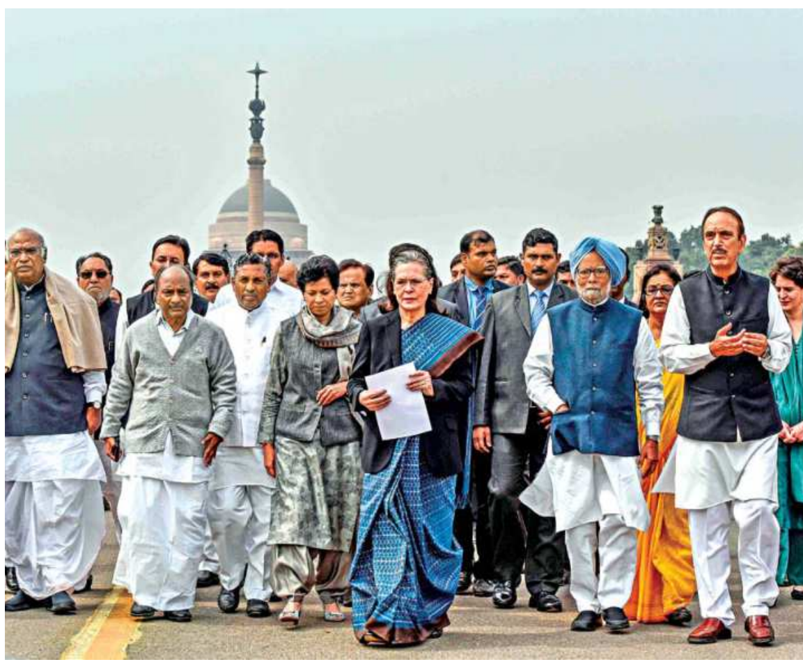
(From left, clockwise) A Congress delegation led by party chief Sonia Gandhi (C) walk to meet India's President Ram Nath Kovind and submit a memorandum on the violence in the capital city, in New Delhi, yesterday; activists of the All India Trinamool Congress party in Kolkata hold electric candles during a vigil condemning the recent violence in New Delhi; and police personnel detain members of Communist Party of India (CPI) as they demand the resignation of Union Home Minister Amit Shah over the violence.