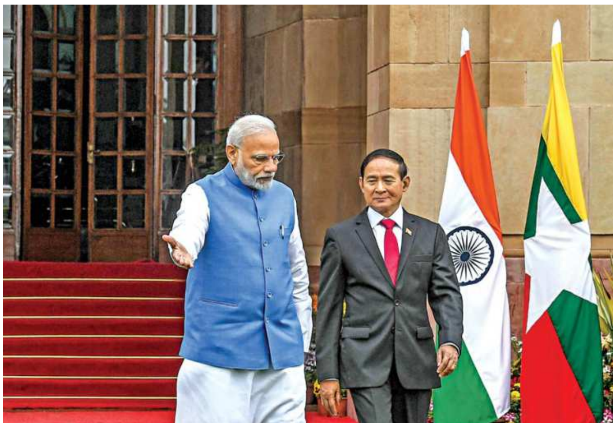
India's Prime Minister Narendra Modi gestures as he walks along with Myanmar's President Win Myint before a meeting in New Delhi, yesterday.