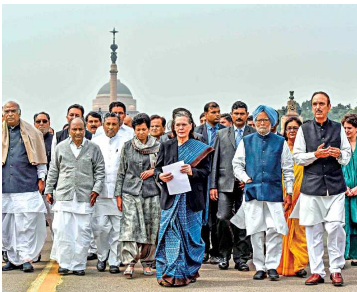
(From left, clockwise) A Congress delegation led by party chief Sonia Gandhi (C) walk to meet India's President Ram Nath Kovind and submit a memorandum on the violence in the capital city, in New Delhi, yesterday; activists of the All India Trinamool Congress party in Kolkata hold electric candles during a vigil condemning the recent violence in New Delhi; and police personnel detain members of Communist Party of India (CPI) as they demand the resignation of Union Home Minister Amit Shah over the violence.