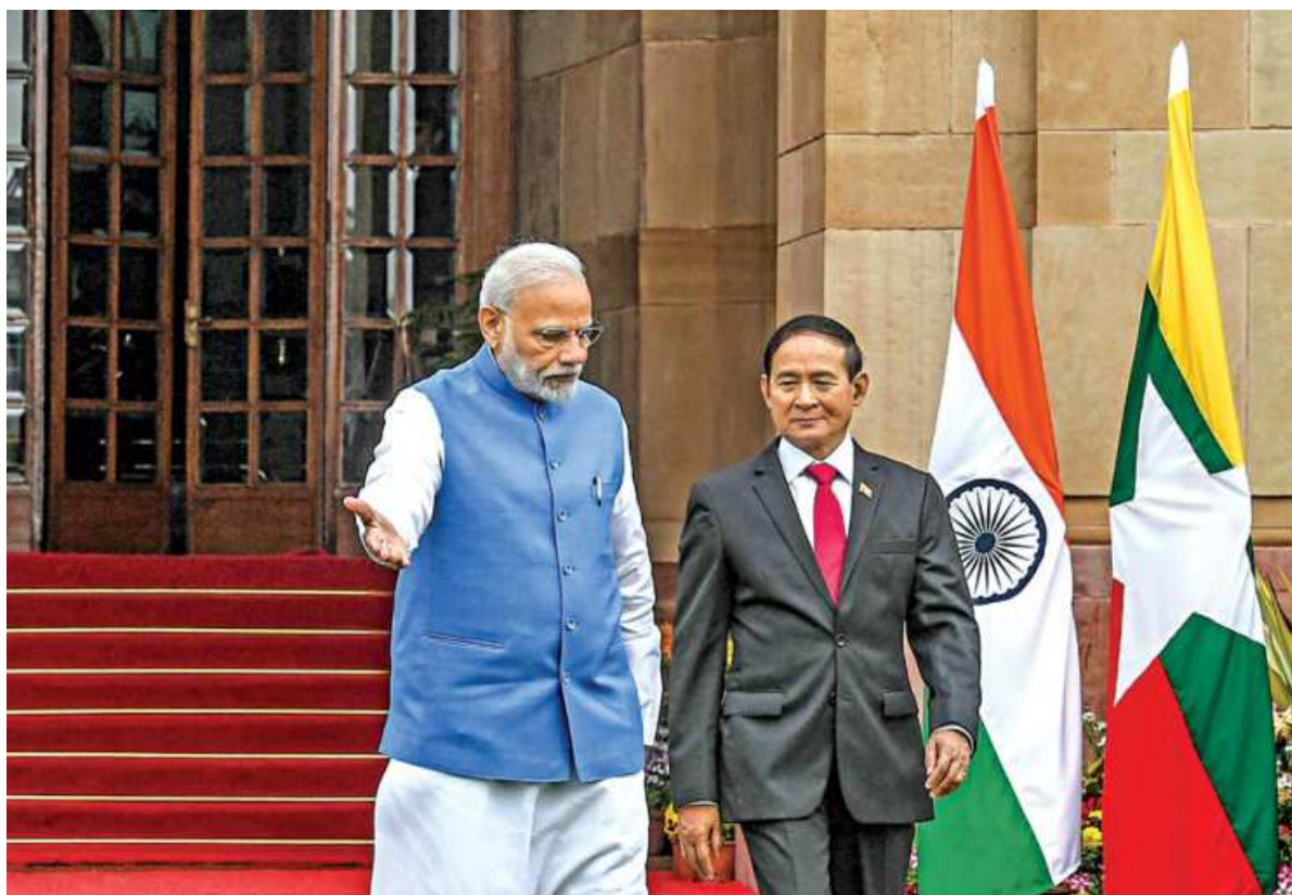
India's Prime Minister Narendra Modi gestures as he walks along with Myanmar's President Win Myint before a meeting in New Delhi, yesterday.