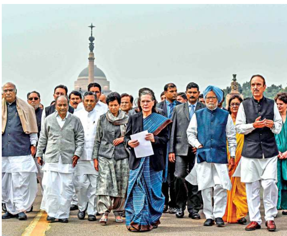
(From left, clockwise) A Congress delegation led by party chief Sonia Gandhi (C) walk to meet India's President Ram Nath Kovind and submit a memorandum on the violence in the capital city, in New Delhi, yesterday; activists of the All India Trinamool Congress party in Kolkata hold electric candles during a vigil condemning the recent violence in New Delhi; and police personnel detain members of Communist Party of India (CPI) as they demand the resignation of Union Home Minister Amit Shah over the violence.