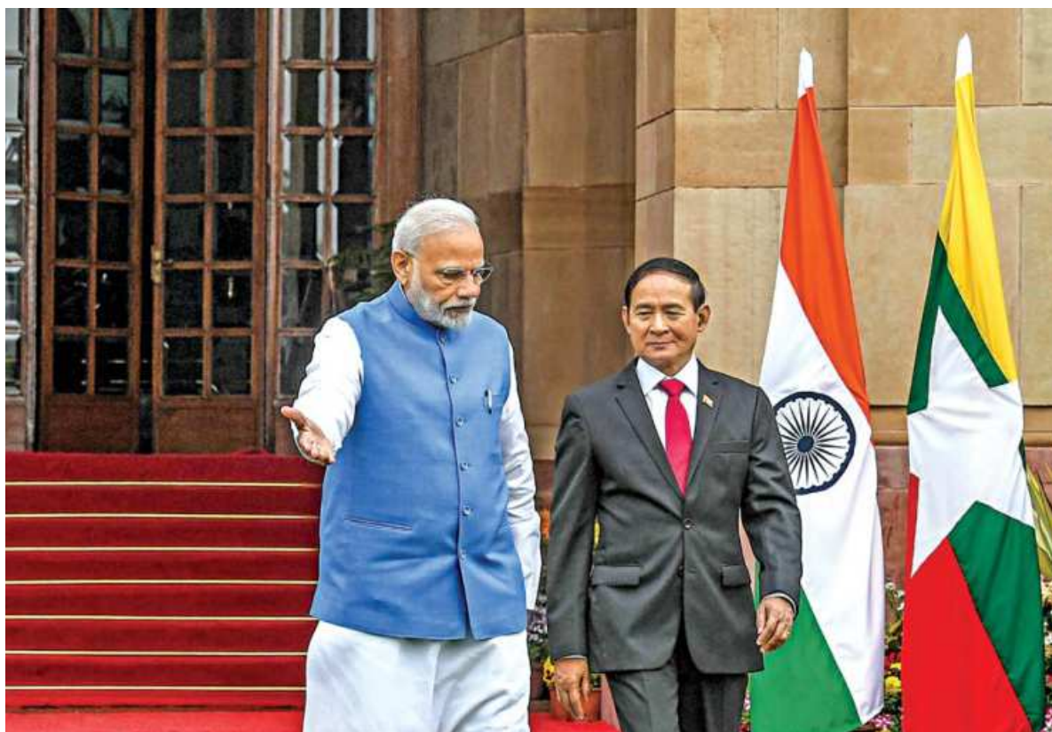
India's Prime Minister Narendra Modi gestures as he walks along with Myanmar's President Win Myint before a meeting in New Delhi, yesterday.