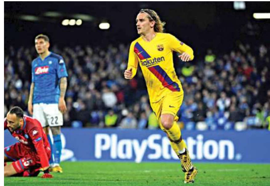
Barcelona forward Antoine Griezmann celebrates his equalising goal against Napoli in their Champions League fixture at the San Paolo Stadium on Tuesday.

The Portuguese full-back crossed low for Griezmann to power home right-footed.