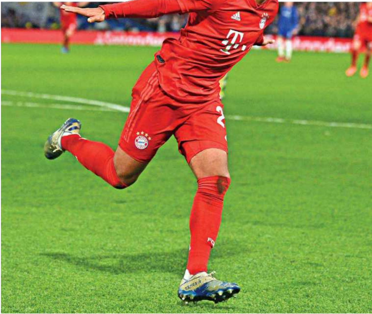
German striker Serge Gnabry scored twice in space of three minutes before Robert Lewandowski added a third as Bayern Munich ran 3-0 winners against Chelsea in their UEFA Champions League fixture at Stamford Bridge in London on Tuesday.