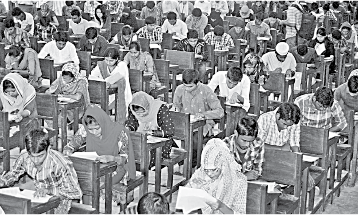
In a May 2013 study, the UGC found that a university admission seeker has to spend an average of Tk 43,100 on coaching and other admission related expenditures.

This is where the differing sides do agree, that organising such an admission test would be a daunting task and there should be proper mechanisms in place to stop any irregularities. But because the tendency to politicise any and all institutions is widespread in our country, that brings with it its own sets of challenges. Can those challenges be overcome?