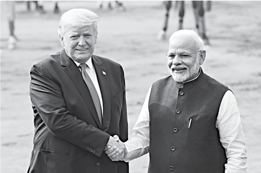
US President Donald Trump and Indian Prime Minister Narendra Modi.