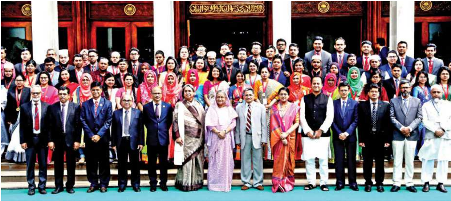
Prime Minister Sheikh Hasina with the recipients of Prime Minister Gold Medal-2018 yesterday. The premier handed over the medals to 172 meritorious students from 36 universities as they secured the highest scores in their faculties. University Grants Commission organised the event at PMO.