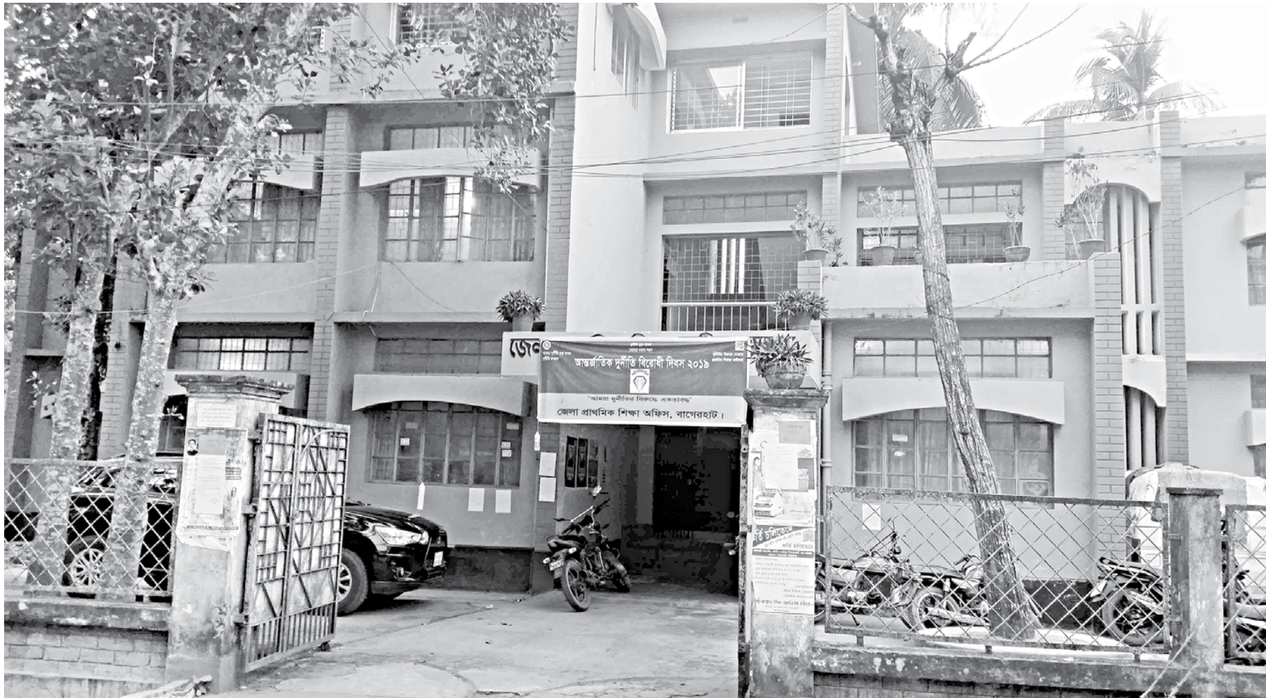
Bagerhat district primary education office.