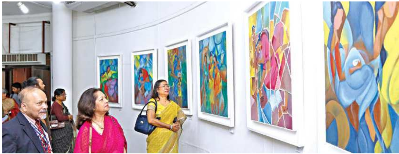
Esteemed guests and visitors at the exhibition.