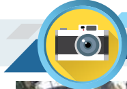
PHOTO OF THE DAY