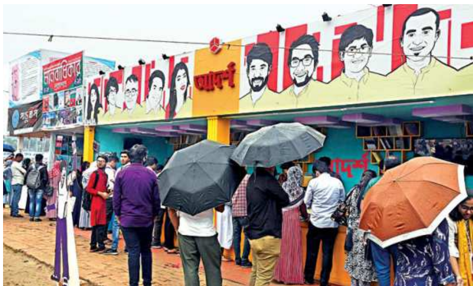
What's a little rain compared to the high spirits of booklovers -- who thronged the Amar Ekushey Grantha Mela yesterday wielding umbrellas and smiles.