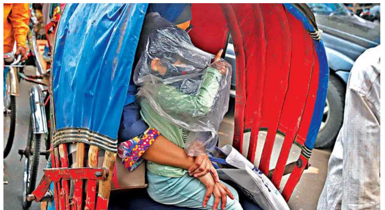
It drizzled on and off all day. But a mother always stays alert to protect her children. While travelling on a rickshaw, this woman quickly covered her daughter in a plastic sheet as soon as it started raining yesterday afternoon. The photo was taken in Dholaihal truck stand area.