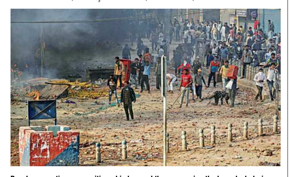
People supporting a new citizenship law and those opposing the law, clash during a protest in New Delhi on Monday.

Over 130 hurt as clashes erupt over CAA for 2nd day; curfew imposed, shoot at sight ordered; shops burnt; schools, metro shut