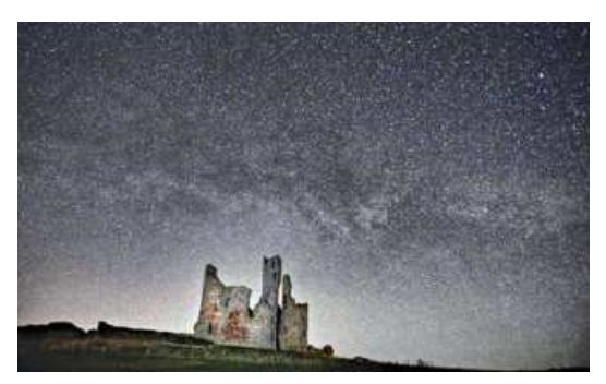
INDEPENDENT CO LIK

Astronomers have spotted molecular oxygen in another galaxy for the first ever time.