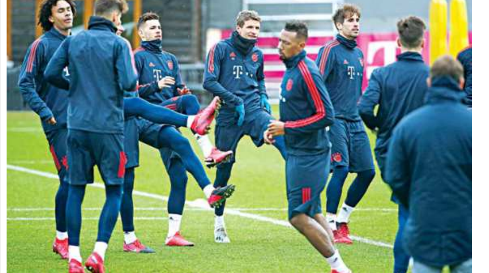
Thomas Mueller (C), seen here in training with Bayern Munich teammates in Munich on Monday, would be looking to prove a point when the Bavarians play away to Chelsea in the Champions League tonight.

He is at his deadliest with perfectly-timed runs and quick passes so that his presence in the penalty area creates space for Lewandowski.