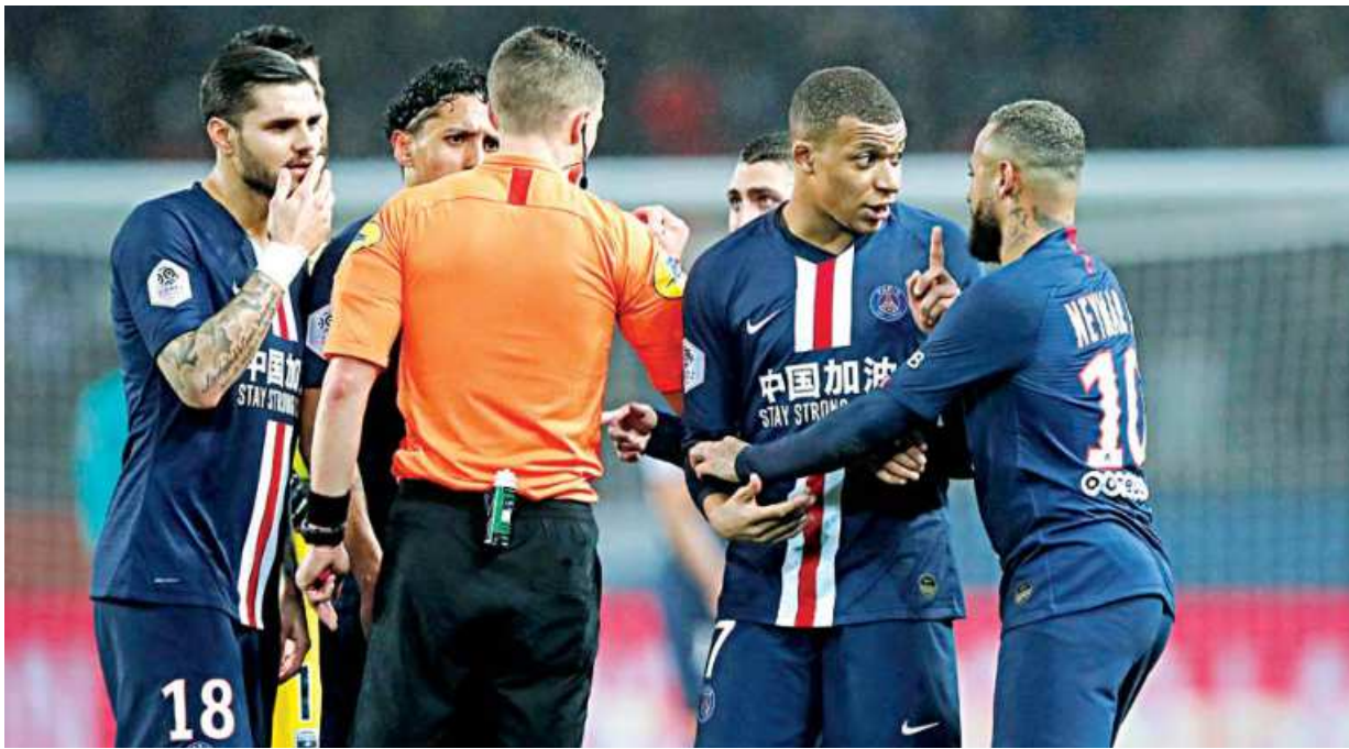
Kylian Mbappe tries to restrain Neymar (R) from remonstrating with the referee following the latter's sending off towards the latter stages of PSG's Ligue 1 match against Bordeaux on Sunday. Marquinhos scored twice while Mbappe and Edinson Cavani scored one apiece as the defending champions won the match 4-3.

"Bayer 04 will have to make do without Volland for about three months," the club said on Monday following an extensive medical check.