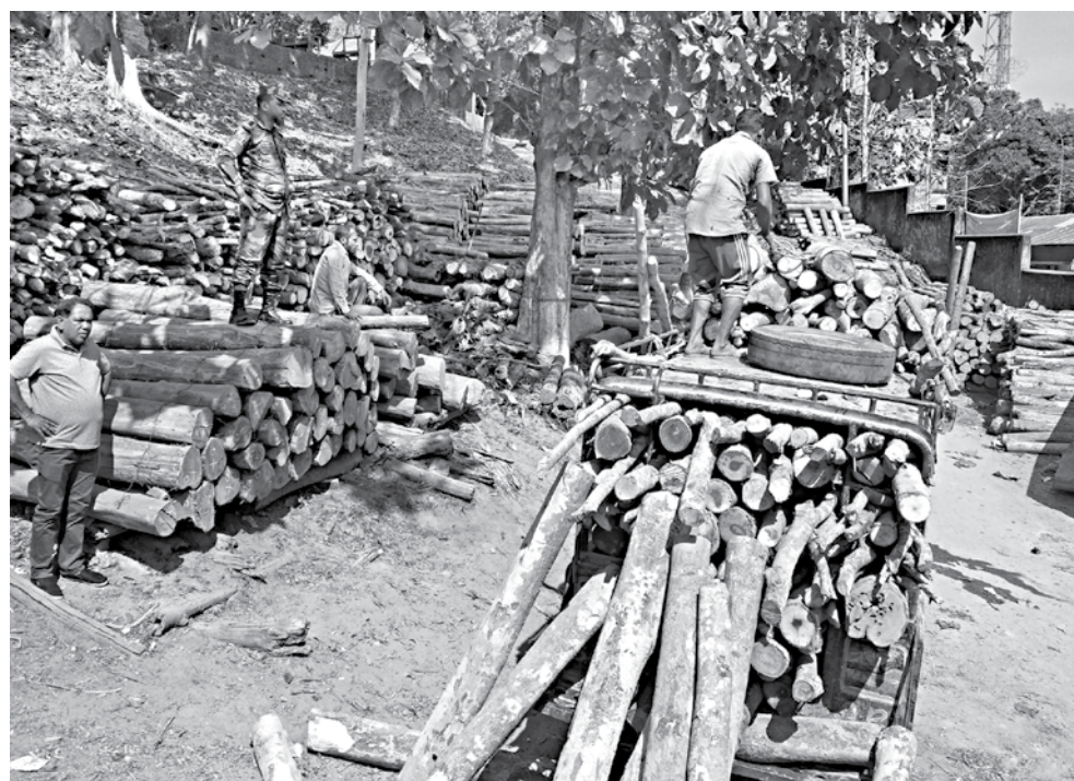
Forest officials seized these logs worth Tk 75 lakh from different villages near Rangamati's Kaptai reserve forest area in the last two months. The photo was taken from Kaptai Range Office compound yesterday.

Later, a team of IEDCR collected samples and found one of the five victims were infected by Nipah virus.