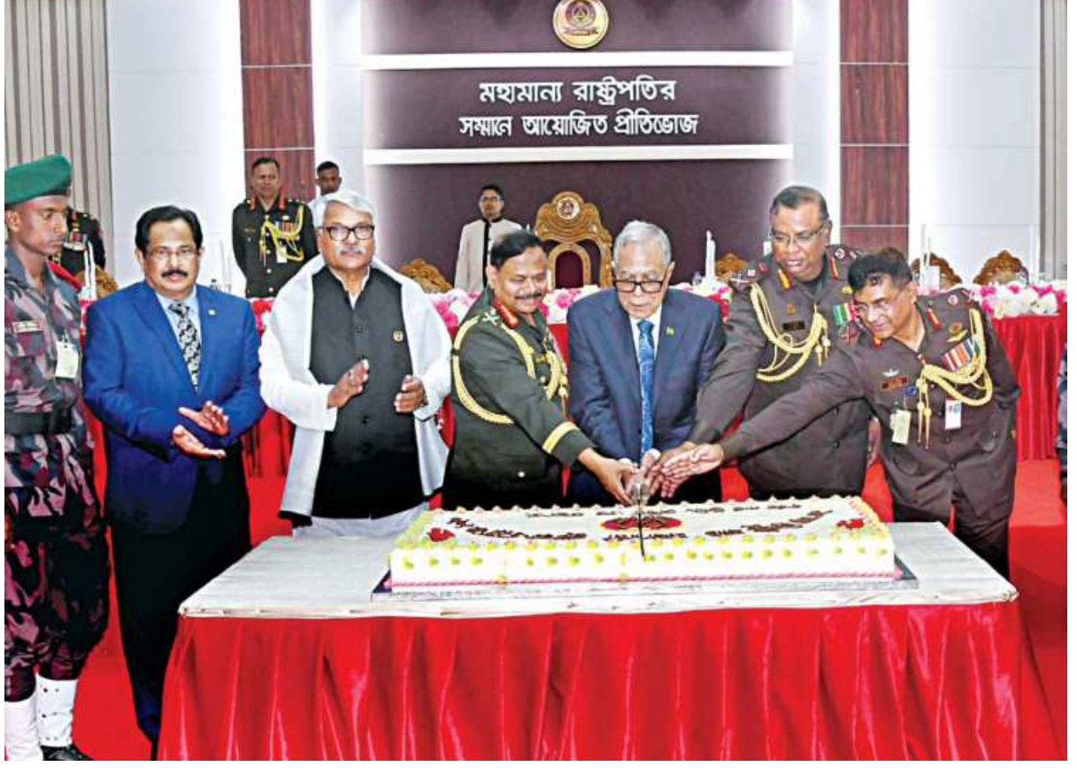
President Abdul Hamid cutting a cake at a programme organised marking the passing-out parade of the 94th recruit batch of Border Guard Bangladesh at Bir Uttam Mujibur Rahman Parade Ground in Chattogram yesterday.