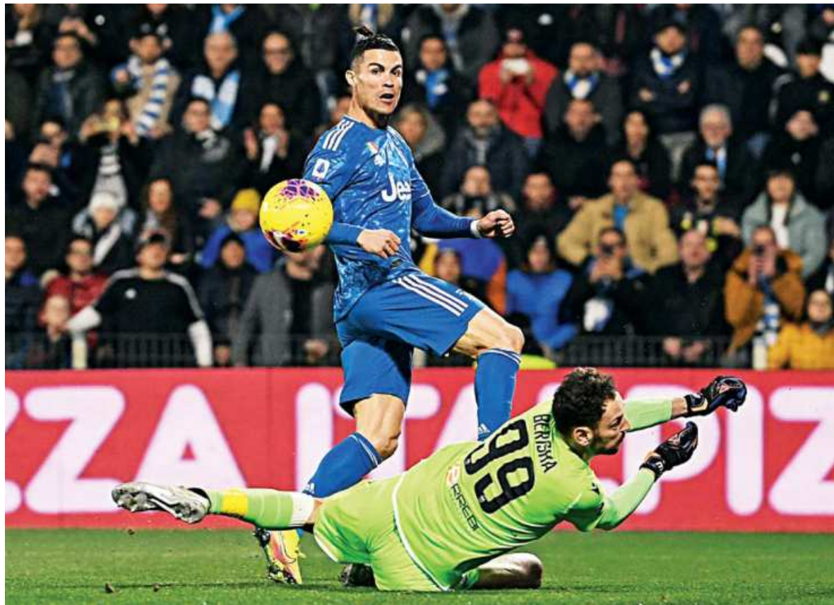
Cristiano Ronaldo scored the opening goal against SPAL on his 1000th professional appearance at the Paolo-Mazza Stadium in Ferrara on Saturday. Juventus won the match 2-1.