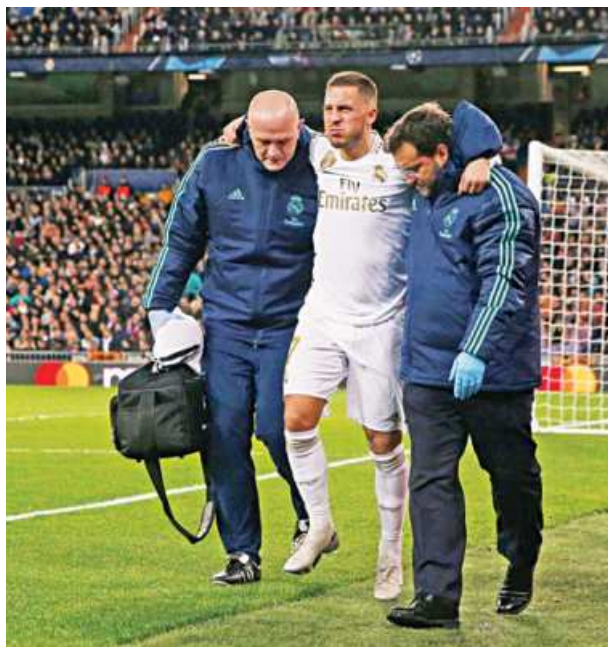
Eden Hazard limped off with an ankle injury during Real Madrid's 1-0 defeat at Levante on Saturday.

"We wasted a lot of chances, we began well but got worse as the game went on and we have lost three points."