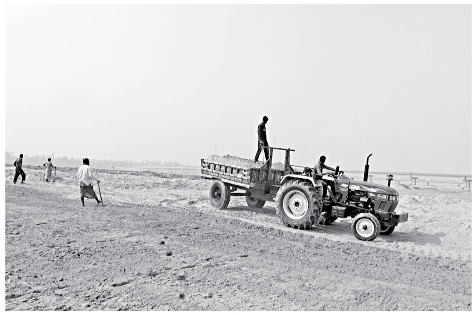
Mindless sand lifting from Teesta riverbed at Teesta village in Lalmonirhat Sadar upazila poses erosion threat to nearby Teesta Road Bridge.