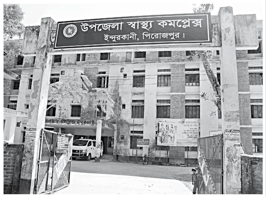
Indurkani Upazila Health Complex in Pirojpur.

The situation becomes worse at night, he said. At least 30 patients come to the outdoor