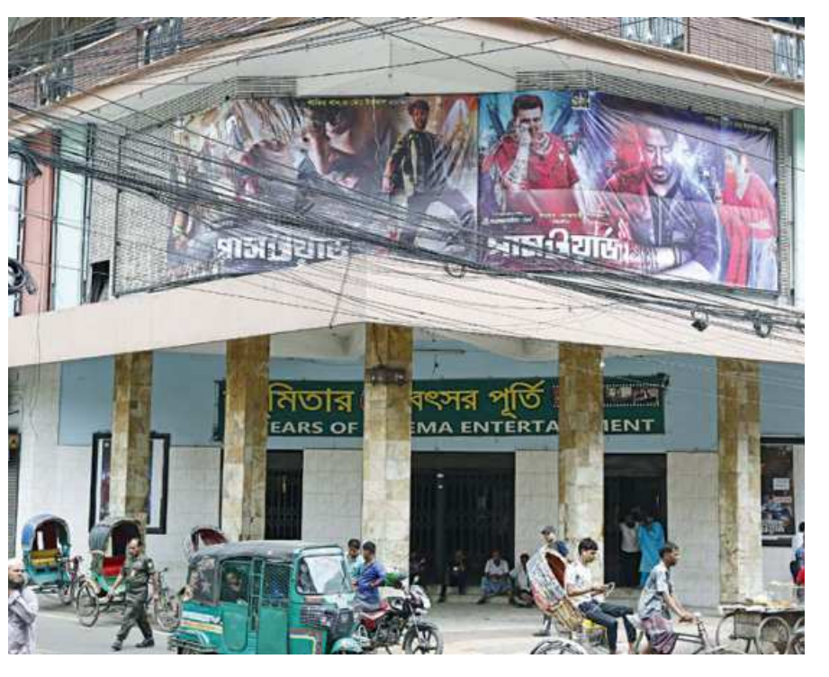
Madhumita Cinema Hall.