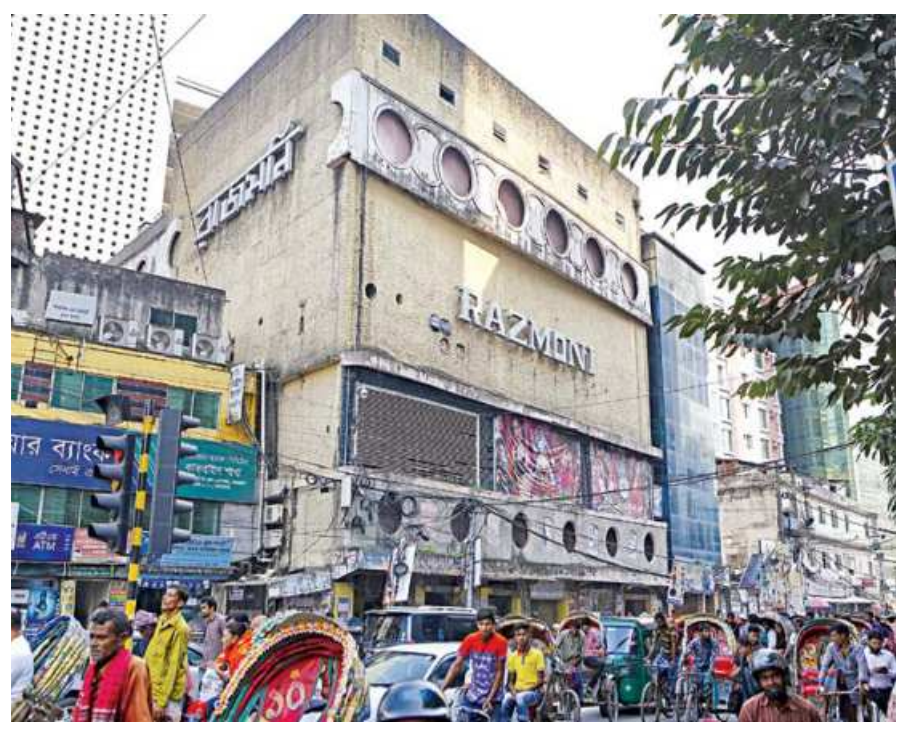
Razmoni Cinema Hall was recently closed down.

Cartoon Exhibition Title: Shojonghati Rekha Venue: Kala Kendra Date: February 21 - March 17 Time: 4:30 pm - 8:30 pm