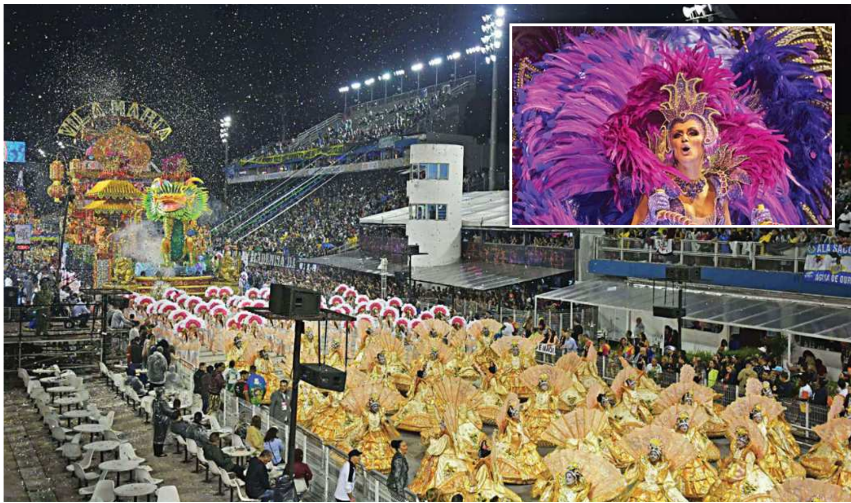
Revellers of the Agua de Ouro samba school performs during the second night of carnival in Sao Paulo, Brazil, at the city's Sambadrome early yesterday. Inset, A reveller dances during the second of carnival.

Belying his earlier claim that mainstream Pakistan opposition parties are on the same page, Pakistan Peoples Party (PPP) chairman Bilawal Bhutto-Zardari on Saturday targeted the Pakistan Muslim League-Nawaz, saying that like Imran Khan PML-N supreme leader Nawaz Sharif had also been 'selected' (by the establishment) for the post of premier. "Before Imran Khan, Nawaz Sharif was a selected premier," he said while talking to reporters at Bilawal House in Bahria Town here. When contacted for the PML-N's reaction, a couple of its parliamentarians said they could give a befitting reply to the PPP chairman's tirade against the Sharif brothers but this was not an appropriate time. SOURCE: AFP, DAWN