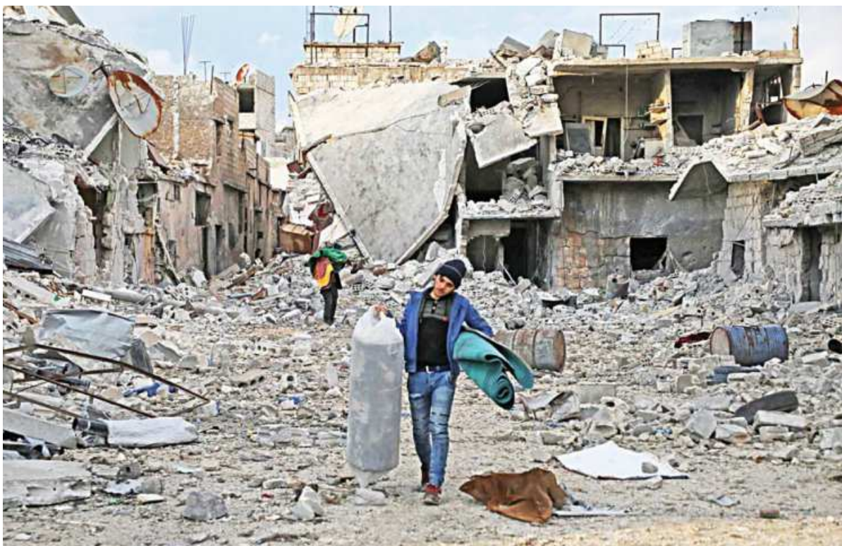
Syrians salvage some of their belongings from the rubble of houses as they prepare to flee the town of Atareb in the rebel-held western countryside of Syria's Aleppo province, on Saturday.