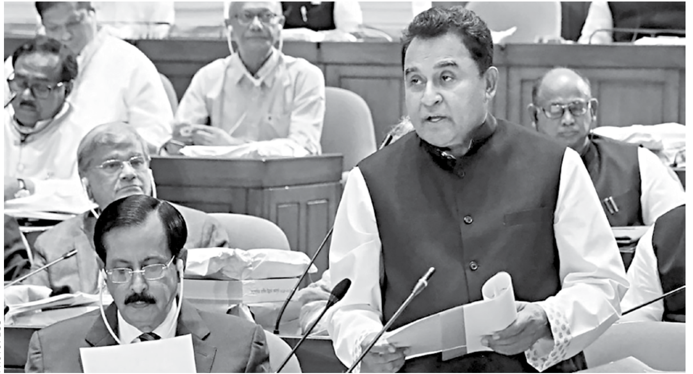
Finance Minister AHM Mustafa Kamal delivers his FY 2019-20 budget speech at parliament in Dhaka, on June 13, 2019.

In addition to these reforms, the National Commission on Money, Banking and Credit was constituted in 1984 under the direction of the World Bank. In 1996, a banking commission and in 2002, a banking reform committee were formed. In 2003, the Central Bank Strengthening Project was carried out for a strong and effective regulatory and supervisory system for the banking sector. The Bangladesh Bank Amendment Bill 2003 was passed in the parliament, through which Bangladesh