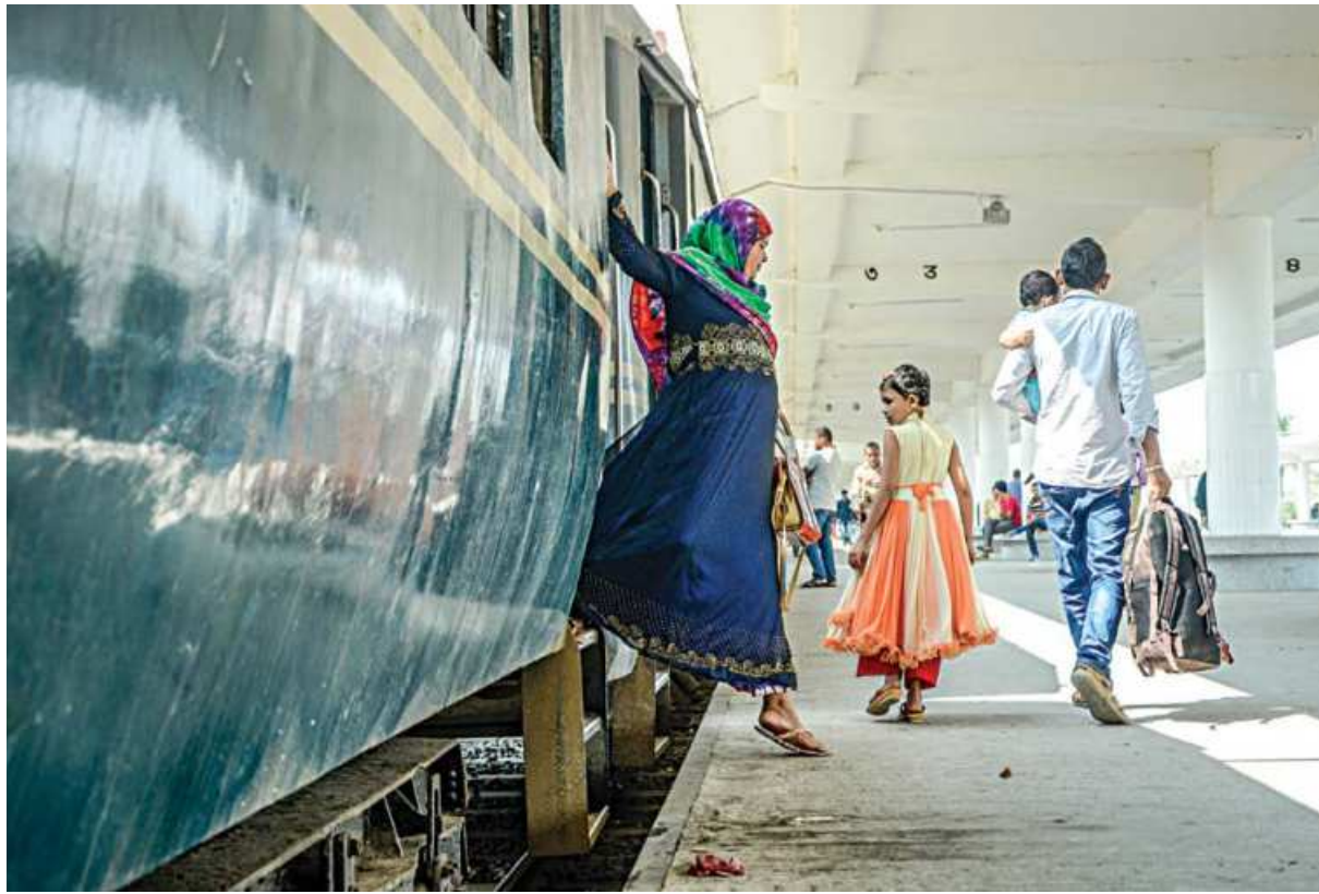
A woman had to be at full stretch to get off a train yesterday as the compartments rest unevenly higher than the surface of the platform at Khulna Railway Station. On Saturday, a former Khulna University professor died after falling under a train when he was trying to get on it at the station.