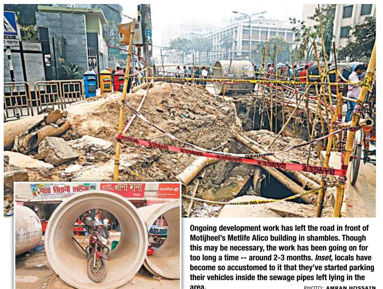
Ongoing development work has left the road in front of Motijheel's Metlife Alico building in shambles. Though this may be necessary, the work has been going on for too long a time -- around 2-3 months. Inset, locals have become so accustomed to it that they've started parking their vehicles inside the sewage pipes left lying in the area.