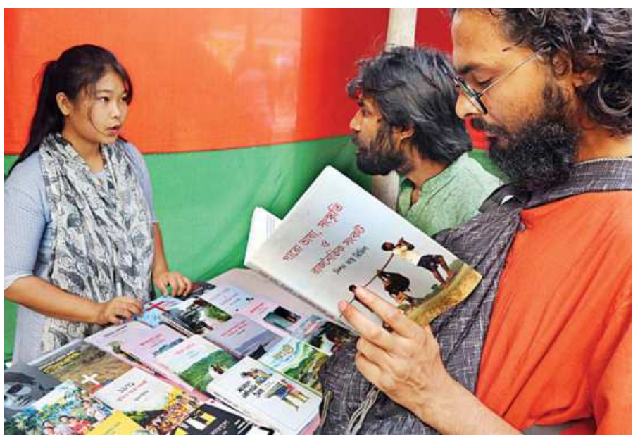
Visitors gather at Thokbirim's stall at Suhrawardy Udyan, learning more about indigenous literature and culture.

Writers seek increased efforts from Bangla Academy