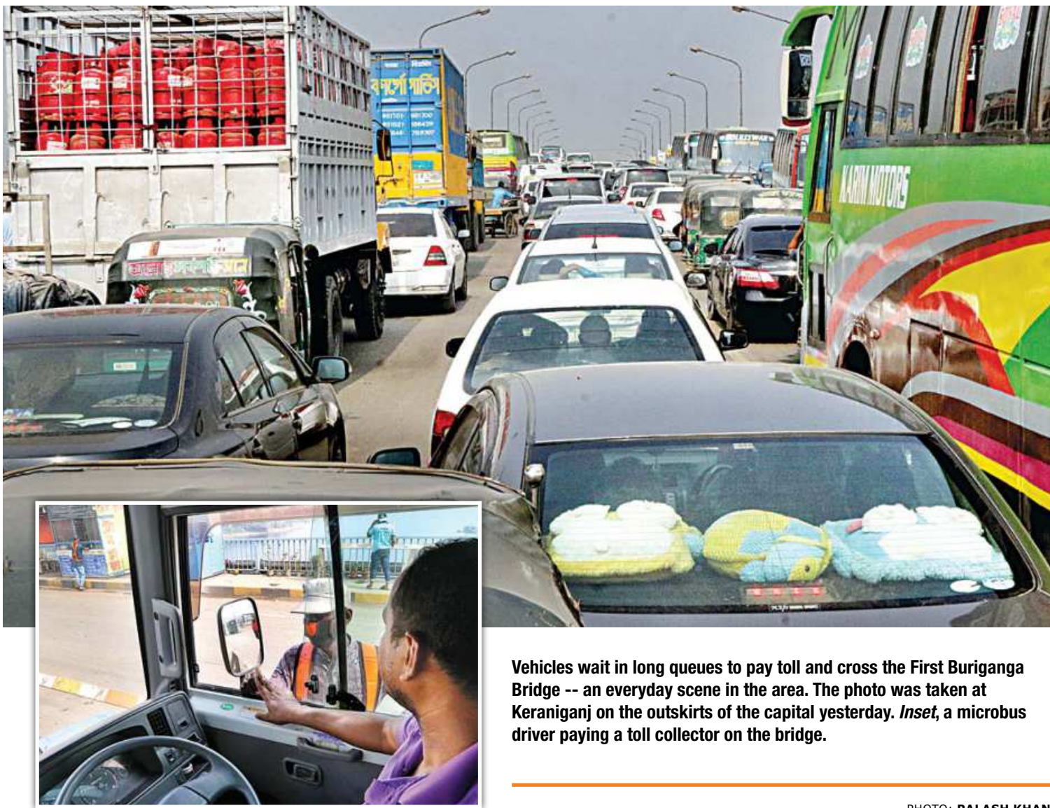
Vehicles wait in long queues to pay toll and cross the First Buriganga Bridge -- an everyday scene in the area. The photo was taken at Keraniganj on the outskirts of the capital yesterday. Inset, a microbus driver paying a toll collector on the bridge.

Between 1990 and 2017, the increase in the road crash fatality rate per capita was three times higher in Bangladesh than that across South Asia, according to a World Bank report. For the highest-risk group—males between the ages of 15 and 49 years—the rate of increase in Bangladesh was 15 times higher than that across the region, it said. The report, titled “Delivering Road Safety in Bangladesh”, was released on Friday in conjunction with the Third Global Ministerial Conference On Road Safety in Stockholm. The report points to the high death rate on Bangladesh's roads caused by chronic lack of investment in systemic, targeted, and sustained road safety programmes and identifies relevant investment priorities to reverse the trend. “Bangladesh has experienced sustained economic growth and made progress on reducing poverty and boosting prosperity. However, these positive trends are being undermined by high fatality and injury rates on the roads of this populous South Asian nation,” the report stated. “The detrimental development impacts of poor road safety performance must be addressed. Road safety performance in Bangladesh is not just poor, it is SEE PAGE 13 COL 4