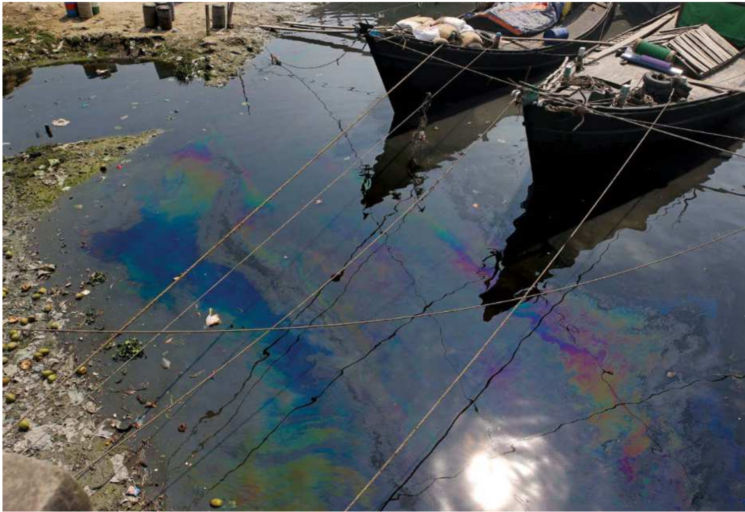
The colour of Naton Chaktai canal's water bears evidence of indiscriminate dumping of used engine oil from boats. The waterbody in Chattogram is connected to the Karnaphuli river. The photo was taken yesterday.