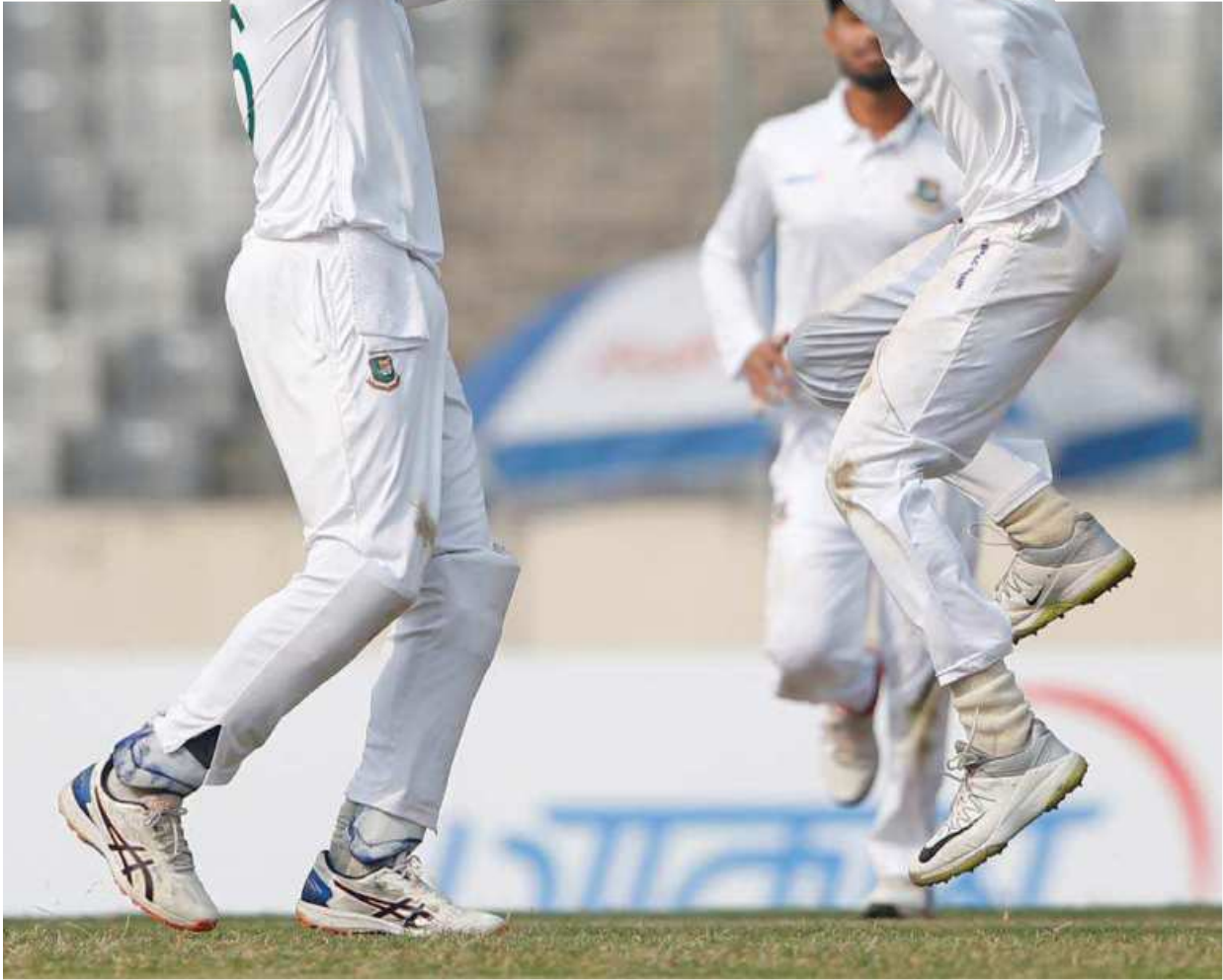
Spinner Nayeem Hasan was the pick of the Bangladesh bowlers with four wickets for 68 runs as the hosts clawed back on the opening day of the one-off Test against Zimbabwe despite Craig Ervine's maiden Test hundred as captain at the Sher-e-Bangla National Stadium in Mirpur yesterday.