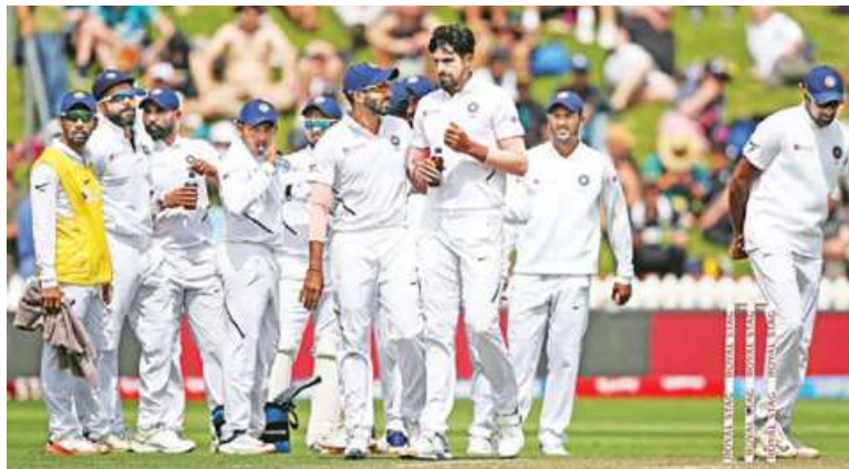
India's Ishant Sharma celebrates the wicket of New Zealand's Tom Latham with teammates in Wellington yesterday.

The second match is in Hambantota on Wednesday.