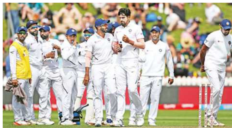
India's Ishant Sharma celebrates the wicket of New Zealand's Tom Latham with teammates in Wellington yesterday.

The second match is in Hambantota on Wednesday.