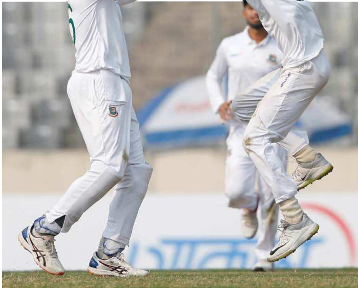
Spinner Nayeem Hasan was the pick of the Bangladesh bowlers with four wickets for 68 runs as the hosts clawed back on the opening day of the one-off Test against Zimbabwe despite Craig Ervine's maiden Test hundred as captain at the Sher-e-Bangla National Stadium in Mirpur yesterday.