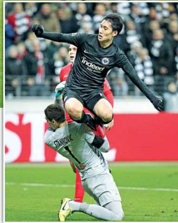
Wolverhampton Wanderers' Portuguese midfielder Diogo Jota celebrates one of his three goals in their Europa League fixture against Espanyol at the Molineux Stadium on Thursday. (Inset) Frankfurt's Japanese midfielder Daichi Kamada, seen here sliding the ball past Salzburg goalkeeper Cican Stankovic, also got three goals on the night.